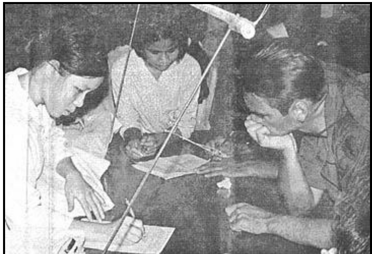
A QUIET CONVERSATION – Soldiers from the 25th Administration Company exchange notes with children they have "adopted" at a Catholic home 25 miles from Cu Chi base camp. The more than 600 children at the home are deaf.

"Our men spend most of their time working in the division staff sections," one officer said. "They like to get out to the villages and meet the people. They enjoy going to Lai Thieu as much as the children enjoy having them visit."