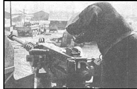
LOOKIN' FOR CHARLIE – Staff Sgt. BoShank, a 3-4 CAV Trooper, mans a "ma duece" in one of the observation posts at Cu Chi base camp. Ever alert and vigilant, Sgt. BoShank ensures the safety of all those who live inside the wire.

Sergeant BoShank, serial number K9-007, is truly an animal with great pride and is, by all means, the best mascot the cavalrymen could have.