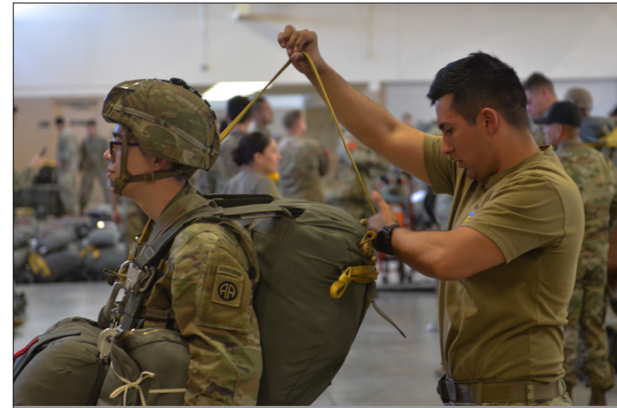
Above A jumpmaster inspects the static line of a paratrooper assigned to the 3rd Brigade Combat Team, 82nd Airborne Division. The jumpmaster conducted a personnel inspection for Operation Panther Storm March 28, at Fort Bragg's Pope Army Airfield.