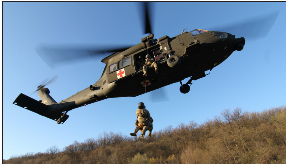
Above U.S. Army combat medics conduct hoist training using an HH-60 Black Hawk helicopter in conjunction with medical evacuation training at Novo Selo Training Range, Bulgaria, March 28 in support of the Atlantic Resolve Mission.