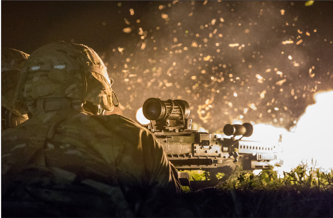
Left Soldiers of Bravo Company, 143rd Infantry (Airborne) returns fire with a squad automatic weapon during the joint forcible entry exercise at Kelly Drop Zone, San Antonio, Texas, March 23, during a mobility mission simulating scenarios that occur while deployed.

Here are the best photos from FORSCOM Public Affairs professionals worldwide. For more photos and information, click these photos or visit army.mil/forscom