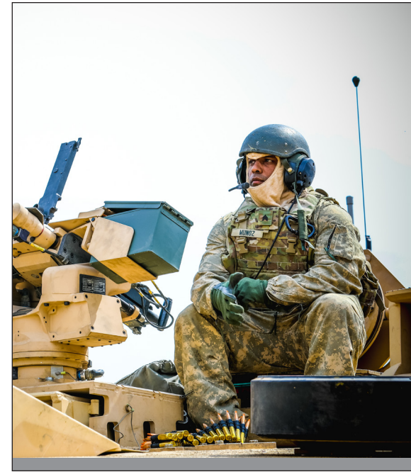
Right Tank crews with 1st Battalion 67th Armor "Death Dealers," 3rd Armored Brigade Combat Team, 1st Armored Division, prepare to qualify at Rodriguez Live Fire Complex, Republic of Korea, March 19, to improve gunnery skills to maintain readiness.