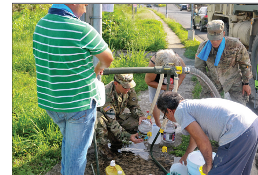
24th Press Camp Headquarters - Soldiers from the 3rd Expeditionary Sustainment Command, Fort Bragg, N.C. help Hurricane Maria survivors get purified water at an "oasis" in Fortuna, Puerto Rico, October 14, 2017.