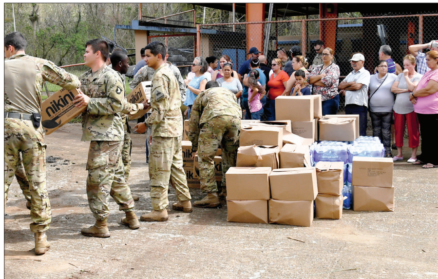
Soldiers with the 6th Battalion, 101st General Support Aviation Battalion, 101st Combat Aviation Brigade, 101st Airborne Division (Air Assault) and from the 1st Armored Division, deliver food and water, Oct. 11, 2017, to Castaner, Puerto Rico.