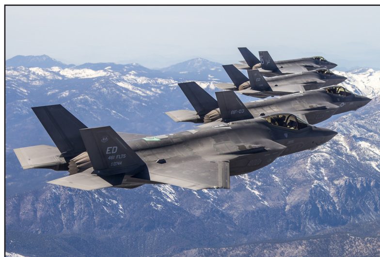
Three F-35As and an F-35C are pictured with the Sierra Nevada Mountains during a recent four-ship test sortie conducted by the 461st Flight Test Squadron.

to be secure and ensure maximum interoperability between 4th- and 5th-generation fighters. The F-35 has an incredible capability to show the entire tactical picture and being able to share this tactical picture with all forces is critical to maximizing lethality, survivability and minimizing the risk of fratricide."