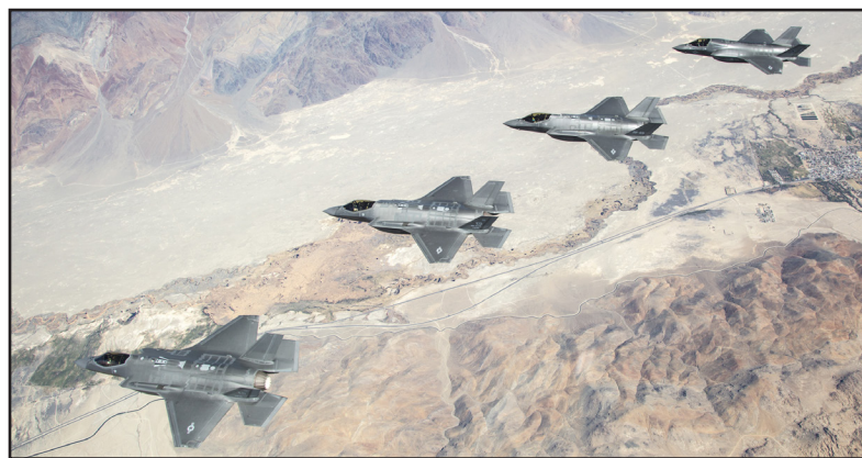
Flocking together: Three F-35As and an F-35C are pictured with the California Desert below during a recent four-ship test sortie conducted by the 461st Flight Test Squadron. Testing is done to ensure data is shared appropriately and accurately between aircraft.

He added that the MADL architecture is divided into flight