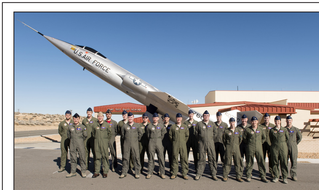
United States Air Force Test Pilot School Class 16A students pose in front of the NF-104 next to the school house.