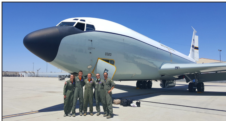
Students from USAF Test Pilot School Class 16A pose in front of a KC-135 Stratotanker from the 418th Flight Test Squadron. During their 11-month course, the 20 students flew in 35 different aircraft as part of the curriculum.

Another portion of the 11-month course is the Test Management Program, a six- to eight-month project that gives the