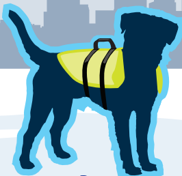
Pets (Harness with lift handles)