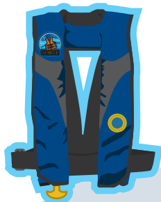
Anglers & Open Motor Boats (Suspender inflatable)