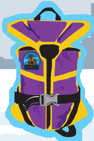
Kids (Adult life jackets don't fit kids)