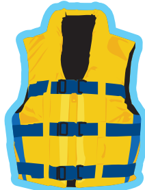
Personal Water Crafts & Water Sports (Inherently buoyant)