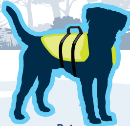
Pets (Harness with lift handles)