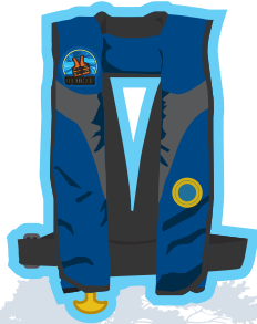
Anglers & Open Motor Boats (Suspender inflatable)