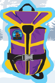
Kids (Adult life jackets don't fit kids)