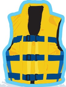
Personal Water Crafts & Water Sports (Inherently buoyant)