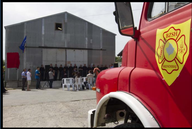
SKENDERAJ, Kosovo -- Firefighters stand in front of their newly donated building at the Skenderaj fire station, July 8. Area Support Team Balkans, in collaboration with the U.S. Embassy in Pristina, donated the building as part a process to help communities in Kosovo improve their capacity for humanitarian response and disaster readiness.