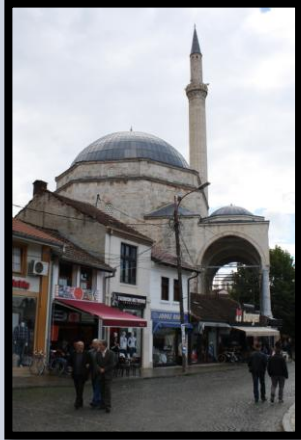
Sinan Pasha Mosque was built in 1615, it stands on high level overlooking the main street in Prizren.