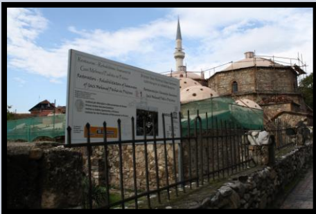
The Turkish Bathhouse locally known as the hamam of Prizren was built in 1573.