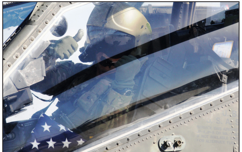
An AH-64D Apache helicopter pilot with B Company, 1-501st Aviation Regiment, Task Force Dragon, gives two thumbs up while at the forward arming and refueling point at Jalalabad Airfield, Afghanistan, May 26.