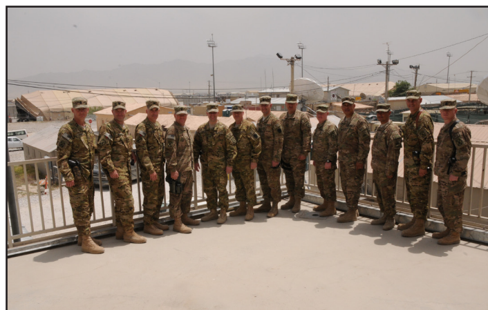
BAGRAM AIRFIELD, Afghanistan - Subordinate task force commanders and their senior enlisted advisors gathered with the TF Falcon commander and senior enlisted advisor at the TF Falcon headquarters building following the transfer of authority ceremony May 19. 10th Combat Aviation Brigade/TF Falcon assumed authority for Army aviation operations in Regional Command - East and Regional Command - North, from the 101st Combat Aviation Brigade/TF Destiny.