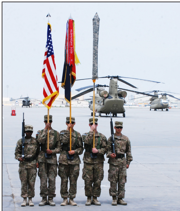
BAGRAM AIRFIELD, Afghanistan - The Honor Guard, the traditional bearer of the Nation’s Colors and the unit colors, perform their duties at the transfer of authority ceremony May 19, in which 10th Combat Aviation Brigade/TF Falcon assumed authority from 101st Combat Aviation Brigade/TF Destiny.

Task Force Falcon is comprised of TF Tigershark, 1-10 Aviation Regiment; TF Knighthawk, 2-10 Aviation Regiment; TF Phoenix, 3-10 General Support Aviation Battalion; all from Fort Drum, NY. The task force is augmented by TF Dragon, 1-501st Aviation Regiment, 1st Armored Division CAB of Fort Bliss, Texas; and TF Iron Warrior 1-104 ARB Pennsylvania National Guard. 🇺🇸