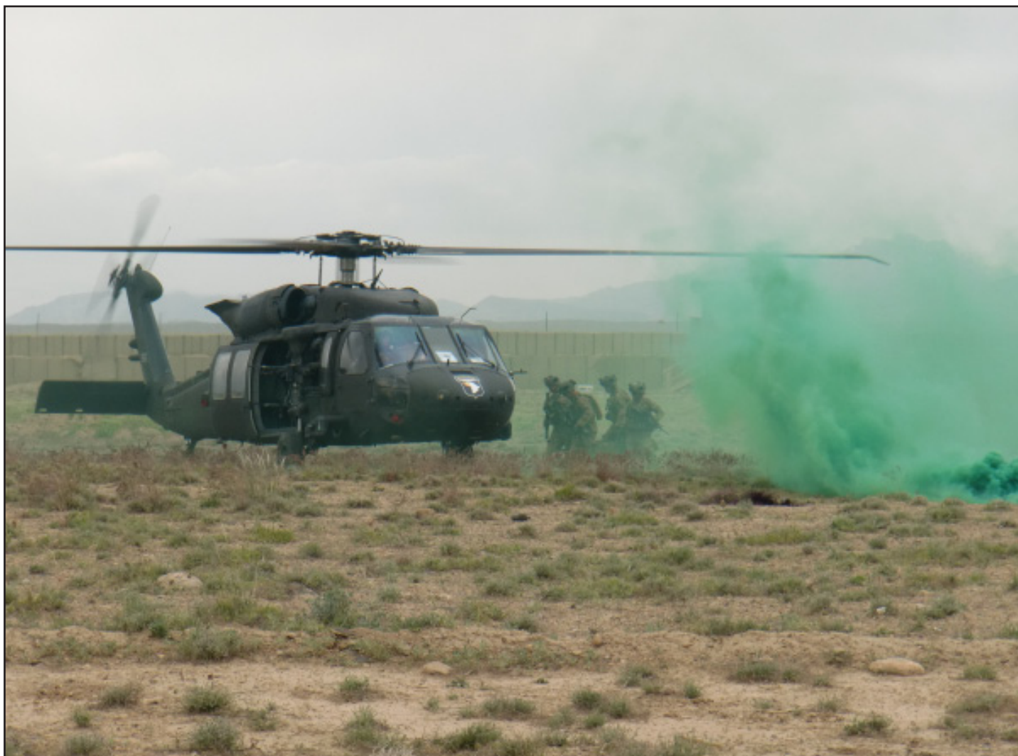
LOGAR PROVINCE, Afghanistan – Soldiers from F Company “Pathfinders”, 2-10 Aviation Regiment, Task Force Knight-hawk, 10th Combat Aviation Briage, conduct personnel extraction combined training with the 101st CAB May 10, 2013, at Forward Operating Base Shank, Afghanistan. The 10th CAB Pathfinders conducted the training to validate their ability to assume the personnel recovery mission for eastern Afghanistan.