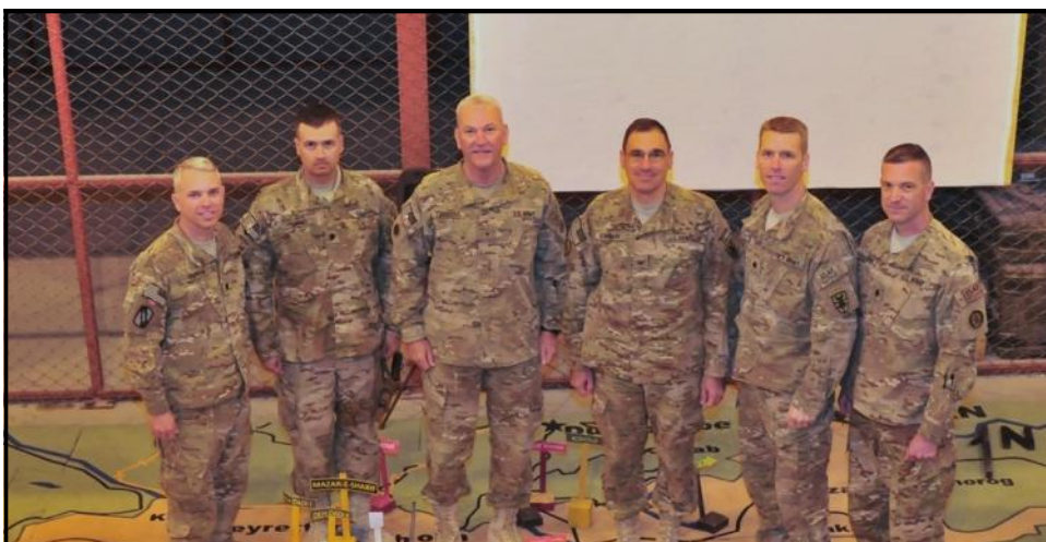
Team members of Resolute!!!