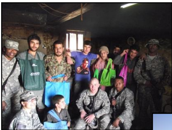
Soldiers from the 298 th CSSB donate needed items to local workers.

As we prepare to celebrate Christmas and the spirit of giving, soldiers from HHD 298 th have been in the giving mood all year. Since April 2011, soldiers from HHD 298 th CSSB have contributed time and effort into providing humanitarian assistance to local villages and schools. From providing medical care for local Afghans to providing schools supplies to students and teachers in need, HHD 298 th CSSB has answered the call. We are proud to be a part of helping the citizens of Shindand. These humanitarian projects improved quality of life by providing essential items to local villages and schools. With the support from family, friends, and businesses back home, HHD 298 th CSSB has formed relationships with the local populace that will be paramount as we continue to make a positive impact in Afghanistan.