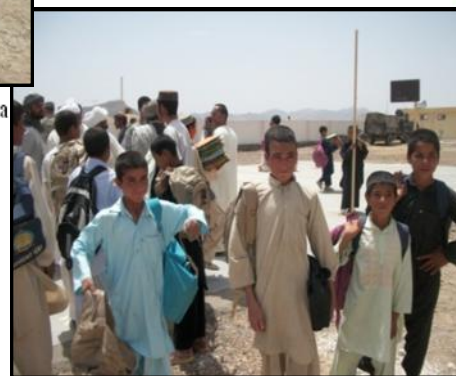
Students at Mandel School in Shindand receive new backpacks and supplies.