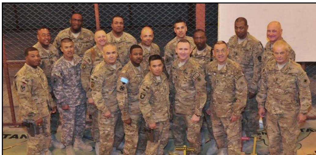
Command Sergeant Majors of the 7th Sustainment Brigade.