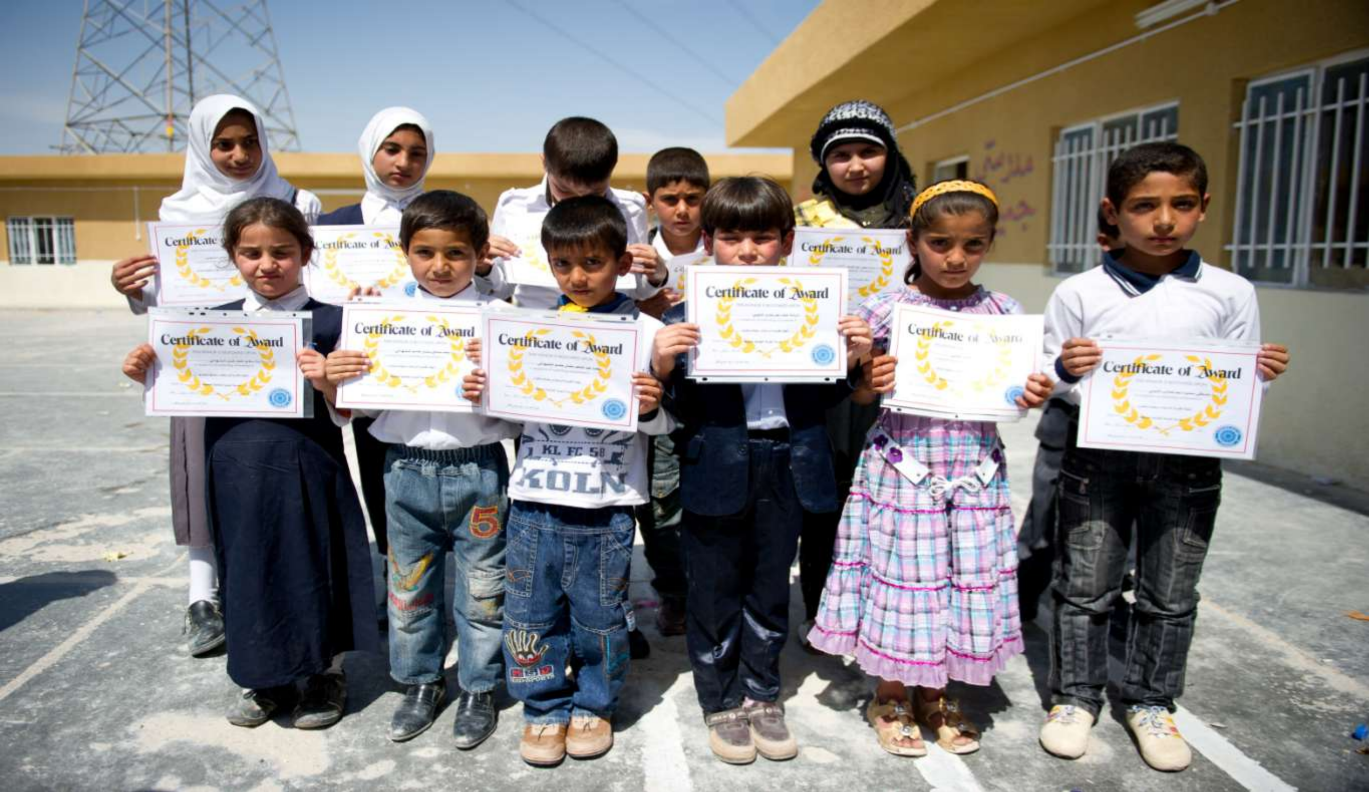
Young Iraqi children pose for a photo on the day their new school is opened in Taji, Iraq, March 20, 2011. U.S. Soldiers assigned to 1st Platoon, Apocalypse Company, 1st Battalion, 18th Infantry Regiment, 2nd Advise and Assist Brigade, 1st Infantry Division, conducted security for a school opening.