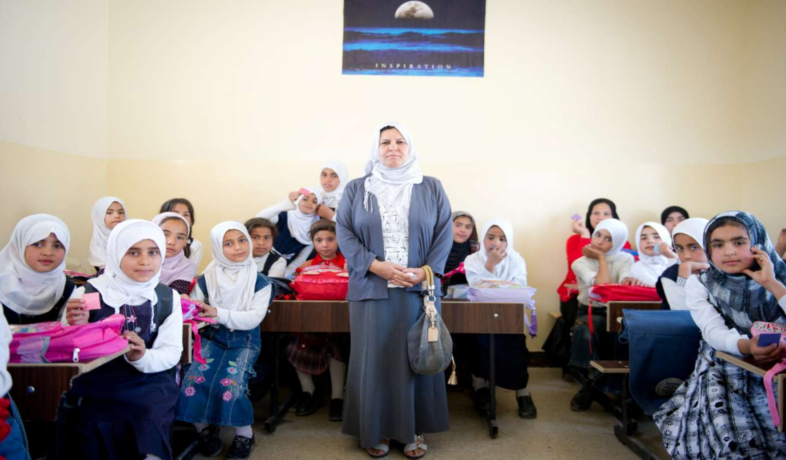
An Iraqi school teacher and her class poses for a photo on the day their new school is opened in Taji, Iraq, March 20, 2011. U.S. Soldiers assigned to 1st Platoon, Apocalypse Company, 1st Battalion, 18th Infantry Regiment, 2nd Advise and Assist Brigade, 1st Infantry Division, conducted security for a school opening.