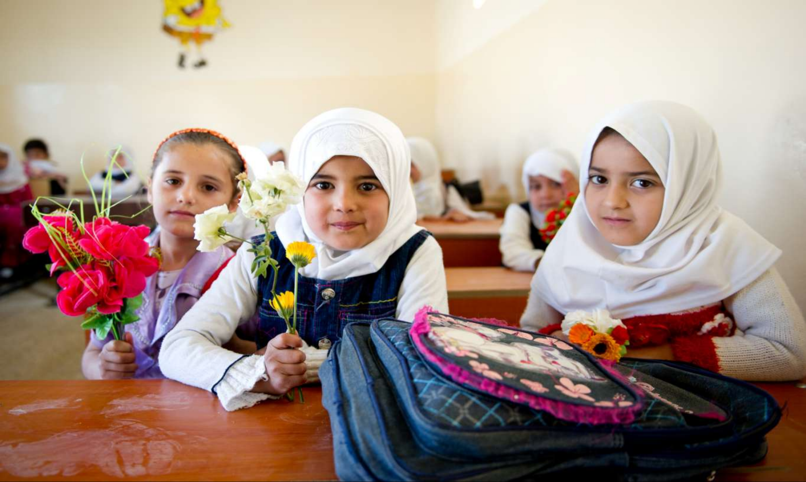
Young Iraqi children pose for a photo on the day their new school is opened in Taji, Iraq, March 20, 2011. U.S. Soldiers assigned to 1st Platoon, Apocolypse Company, 1st Battalion, 18th Infantry Regiment, 2nd Advise and Assist Brigade, 1st Infantry Division, conducted security for a school opening.