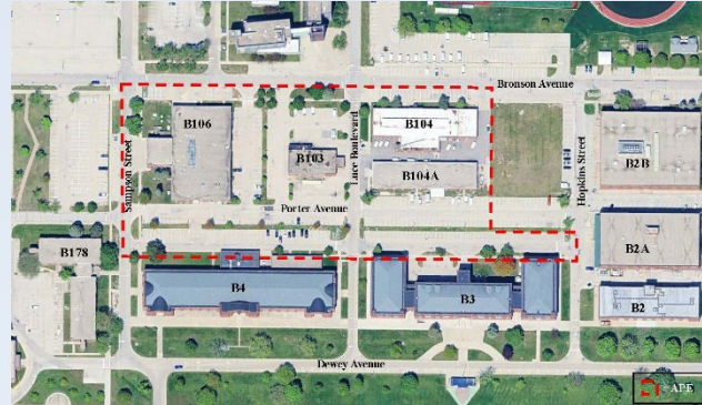
Figure 3 – Proposed APE Map for Building 103