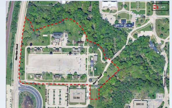
Figure 4 – Proposed APE Map for Buildings 151, 173, and 174