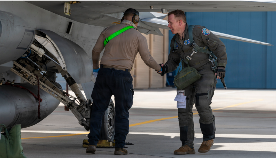
An F-16 Fighting Falcon pilot assigned to the Slovak Armed Forces shakes hands with a U.S. Air Force crew chief assigned to the Indiana Air National Guard after a joint training flight at Morris Air National Guard Base, Tucson, Arizona, Feb. 15.