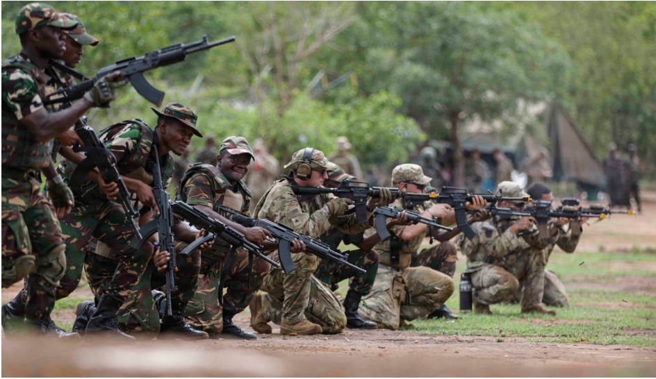
U.S. Soldiers with 2nd Battalion, 134th Infantry Regiment (Airborne), Nebraska Army National Guard conduct infantry squad tactical training in Msata, Tanzania during exercise Justified Accord 26, March, 9.