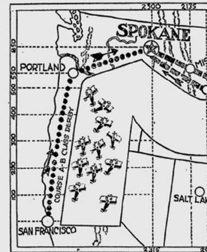
Speeding westward to Spokane from New York are the... is numbered and by referring to the list of entrants below th...