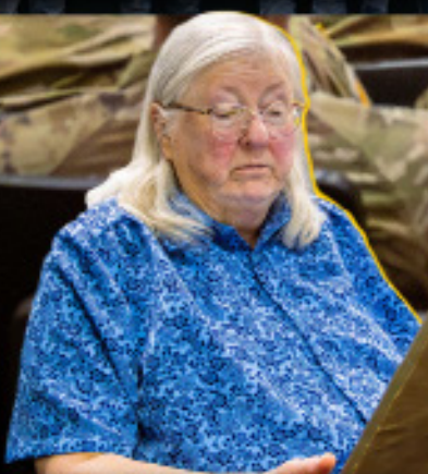
AMCOM historian retires after 39 years of chronicling military history