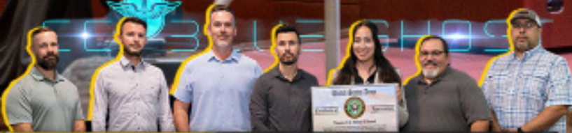
CCAD Wins Top Honors in Army-Wide AI Competition