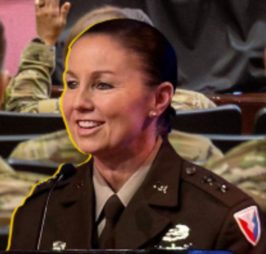
Highlighting the 2026 Army Aviation Warfighting Summit