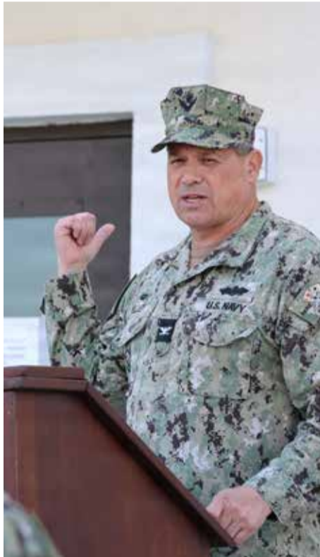
22nd Naval Construction Regiment Commodore Capt. Allen Willey delivers remarks during a ribbon-cutting ceremony for a new expeditionary maintenance facility at Camp Mitchell onboard NAVSTA Rota, Spain, March 23, 2026.

22NCR commands naval construction forces for Navy Expeditionary Forces Europe-Africa/Task Force 68 across the U.S. 6th Fleet area of operations to defend U.S., Allied, and partner interests.