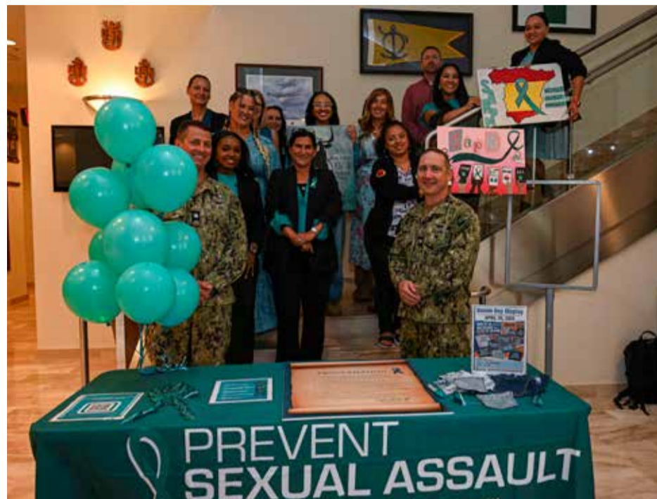
Naval Station (NAVSTA) Rota leadership pose for a photo alongside Sexual Assault Prevention and Response (SAPR) team members with the signed proclamation recognizing April as Sexual Assault Awareness and Prevention Month onboard Naval Station (NAVSTA) Rota, Spain, April 7, 2026.