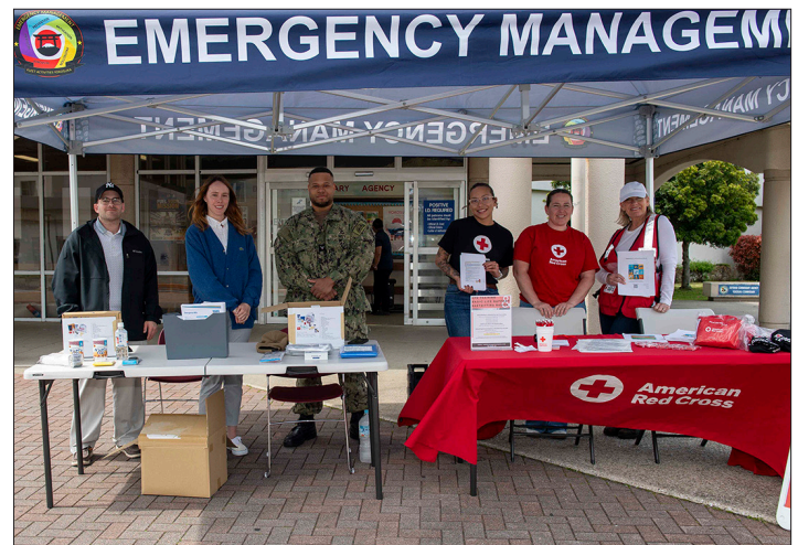
Commander, Fleet Activities Yokosuka's (CFAY) Emergency Management team and American Red Cross volunteers pose for a group photo during CFAY's April Emergency Preparedness Outreach on April 6.

Comprehensive guidance and checklists are available at https://www.ready.navy.mil/ . For additional training and assistance, contact the CFAY Emergency Management Department at cfay.em.dept@us.navy.mil .