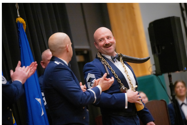
Spirit Award Winner: Maintenance Group