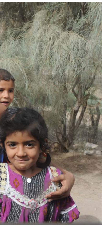
is the introduction of local Iraqi's to Tiger Southern Iraq on Sept. 30.