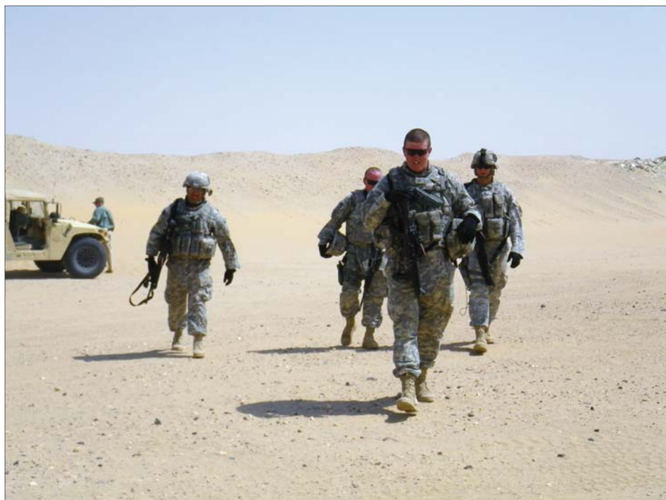
3d ACR Soldiers walk to a nearby M-4 Rifle Range while training in Kuwait. The Soldiers are preparing to deploy to Iraq in support of Operation New Dawn.

Upon arrival in Kuwait, Remington troopers began the monumental task of scheduling training, resourcing the Squadrons with equipment and materials, setting up administrative support, and planning the movement of over 3,000 Troopers north to their final destinations in Iraq. Everybody worked hard and diligently to make this most difficult process as easy on the Soldiers as possible. Shops, large and small, gave their best accomplishing these tasks. For example: S1 worked on maintaining complete accountability of the multitude of Soldiers traveling through the theatre of operations while the ADAM cell coordinated the complex air movements into theater. S4 resourced all the Squadrons during training, while the Fires and Effects Cell led the equipment movement at the port in Kuwait unloading the transport ships in record time. Meanwhile, the Troopers conducted training of their