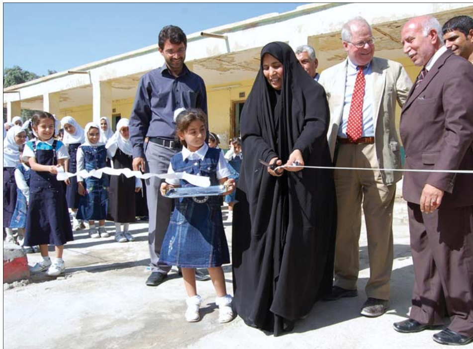
The Head Mistress for the Sudayr Maisalon and As Safaat Girls Primary School cuts a ribbon in a ceremony marking the opening of the schools' new extension Oct. 21, 2010. Looking on, far right, is the Deputy Director General of Education for Iraq.

The school's extension project began in July and the PRT carefully planned it so that its construction would coincide with the beginning of the new school season. The cost of the program was $74,980 USD.