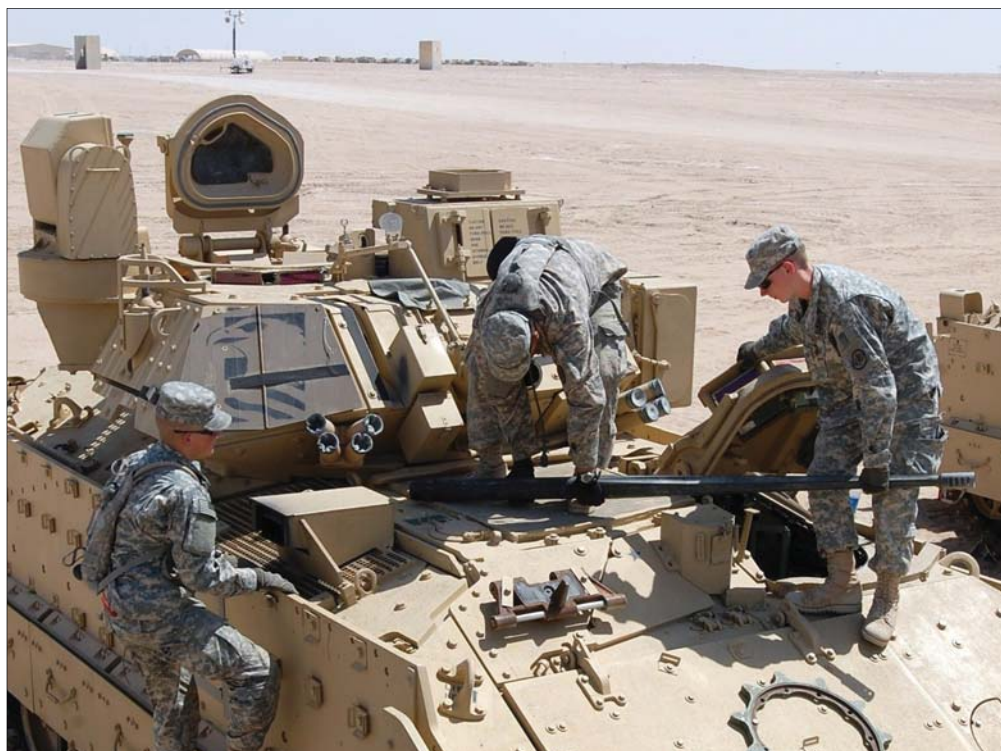
Soldiers of Troop E unload equipment from their Bradley Fighting Vehicle at Camp Beuhring, Kuwait, Sept. 10, 2010. The Soldiers are preparing to assume their mission of advising and assisting the Iraqi government as part of Operation New Dawn.