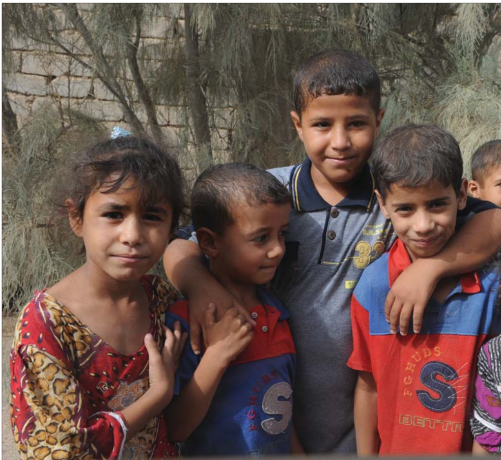
A group of Iraqi children pose for a photograph during a recent tour of their village. The tour was led by the 3d Armored Cavalry Squadron, 3d Armored Cavalry Regiment. The regiment accepted authority of portions of southern Iraq