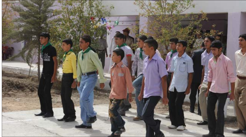
A group of Iraqi students raise the Iraqi flag during the ribbon cutting ceremony at the Al Shitiaa school in Babil, Iraq Oct. 2, 2010. The school was built by Iraqi contractors.