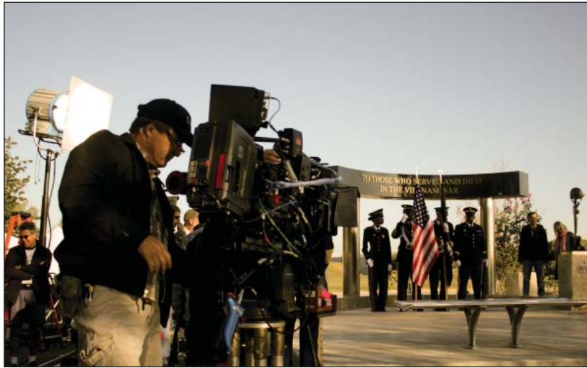
South Carolina Army National Guard, Honor Guard, Region three, on the set of "Army Wives" Mar. 31, Charleston, S.C.