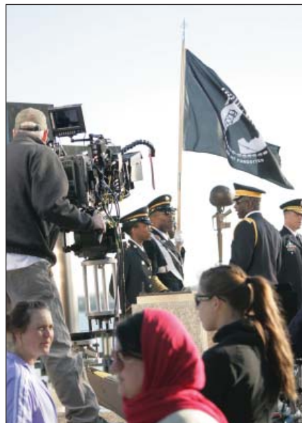
South Carolina Army National Guard, Honor Guard, Region three, on the set of "Army Wives" Mar. 31, Charleston, S.C.