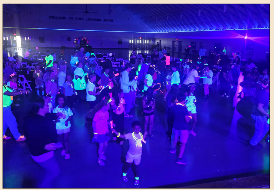
Fort Leonard Wood Family and Morale, Welfare and Recreation

More than 200 partygoers get down at Nutter Field House for the Month of the Military Child Neon Dance Party April 18. Family and Morale, Welfare and Recreation hosted the illuminating event, which also included activities and snacks. The next opportunity to participate in a MOMC event will be the MOMC Palooza set for 10 a.m. to 1 p.m., April 26 at Gerlach Field. For more photos from MOMC events, visit MWR's Flickr page.