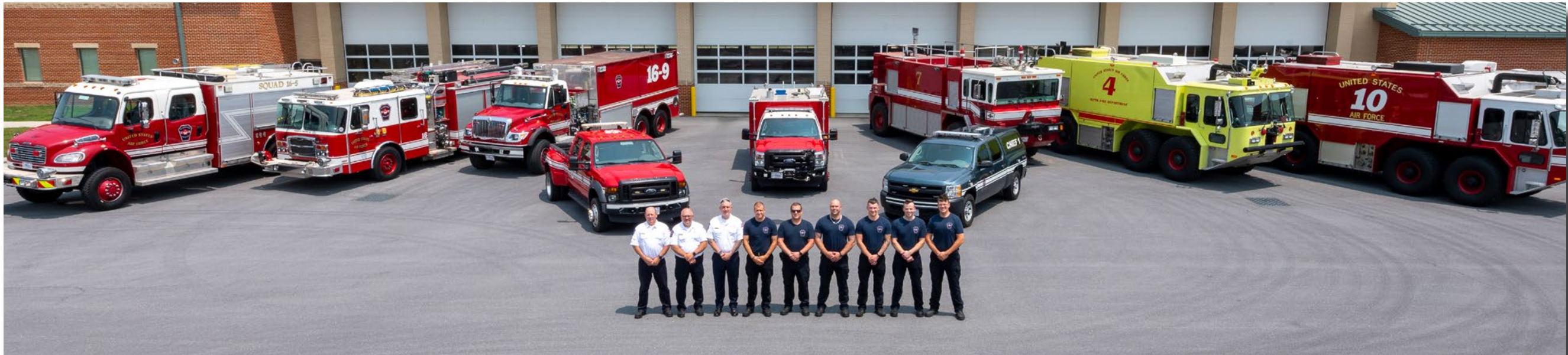
The 167th Airlift Wing's Fire Department, Shepherd Field, Martinsburg, West Virginia, is looking for applicants to fill eight vacancies. With as many as 10 firefighters slated to deploy this spring, low manning in this critical career field could impact operations at the 167th AW. Anyone interested in learning more about the 167th Fire Department can send a message to 167.FES@gmail.com .

If you have questions or would like to apply, send an email to 167.FES@gmail.com . 🐾