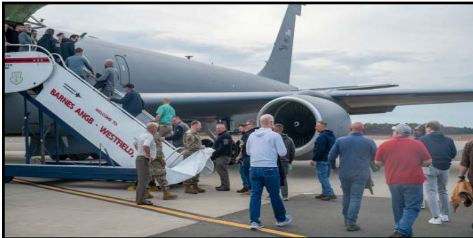
ESGR flights boots mission and community support