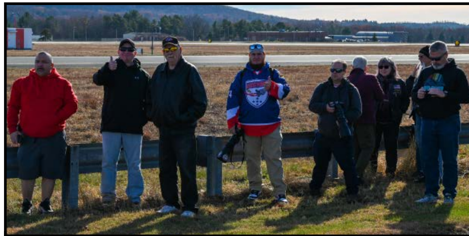
Community and Alumni base tour