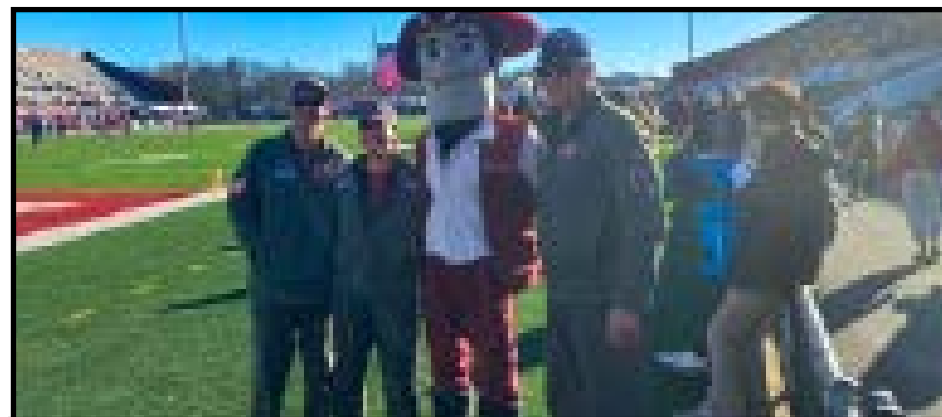
104FW flyover for UMASS