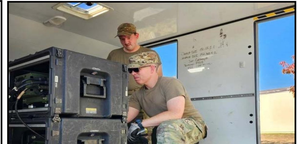
104FW competes in Exercise Noble Skywave