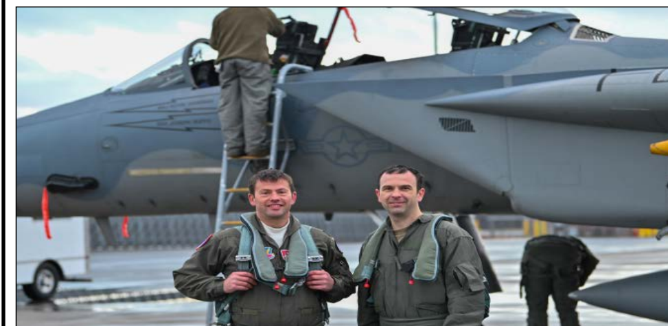
104FW pilot honors brothers retirement