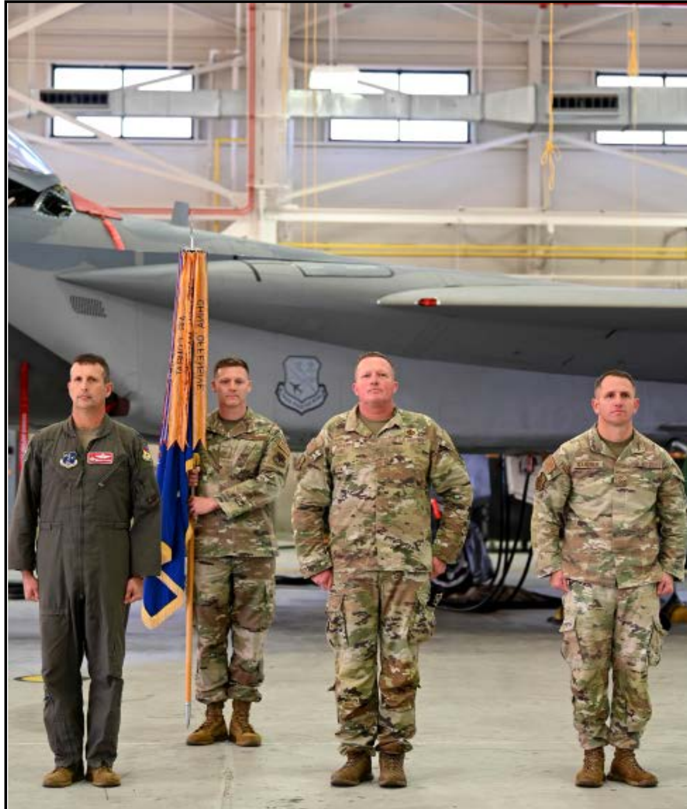
Change of Responsibility Ceremony