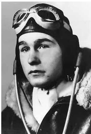
Bush in WWII.

Meacham’s account comes in Part II of “Destiny and Power: The American Odyssey of