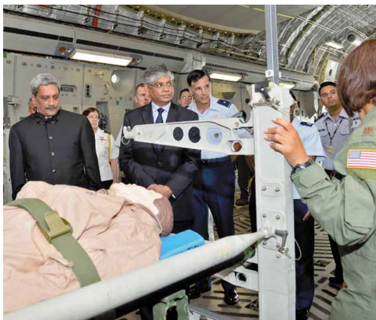
PACAF Airmen demonstrate the aeromedical evacuation capabilities of the C-17 Globemaster III to Manohar Parrikar, the India defense minister (left), and Arun K. Singh, the Indian ambassador to the U.S., Dec. 7 at Joint Base Pearl Harbor-Hickam.