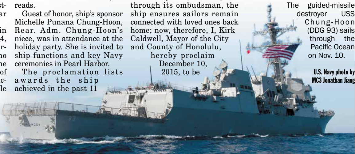
The guided-missile destroyer USS Chung-Hoon (DDG 93) sails through the Pacific Ocean on Nov. 10.

USS Chung-Hoon Day in recognition of the guided-missile destroyer’s years of unparalleled service and her crew’s dedication to protecting life, liberty and the pursuit of happiness for the American people.”