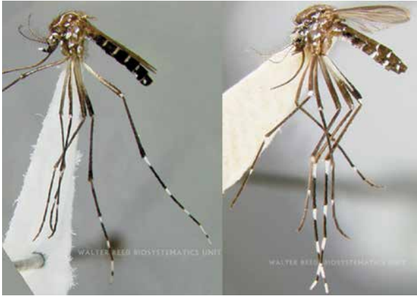
The primary mosquitoes that transmit dengue fever, the yellow fever mosquito ( Aedes aegypti ) (left) and the Asian tiger mosquito ( Aedes albopictus ) (right).

"Dengue is a virus that is transmitted by (certain types of) infected female mosquito and ... it makes you feel really crummy for a couple of weeks," Gerardo said. Symptoms include