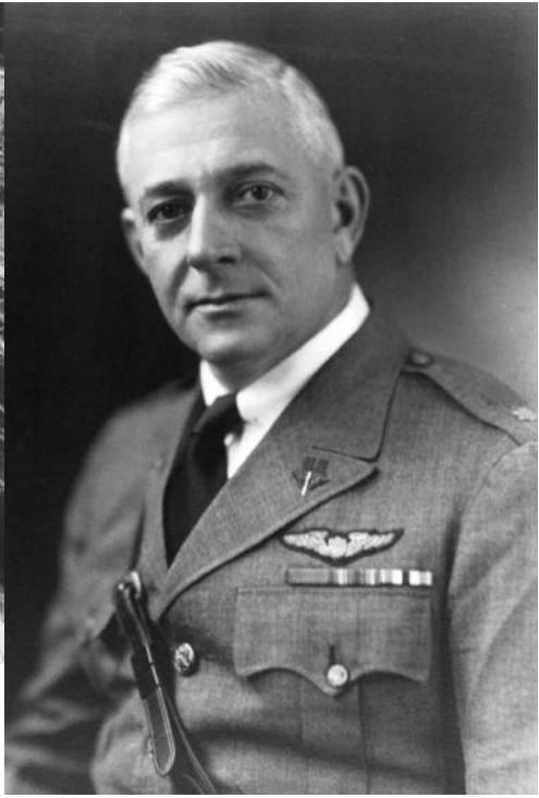
(Right) Portrait photograph of Lt. Col. Horace M. Hickam taken about 1934.

tructure, initial hangars and roads were accomplished in 1936 and 1937 as more buildings were completed, including the base water tower, operations building and a number of hangars.