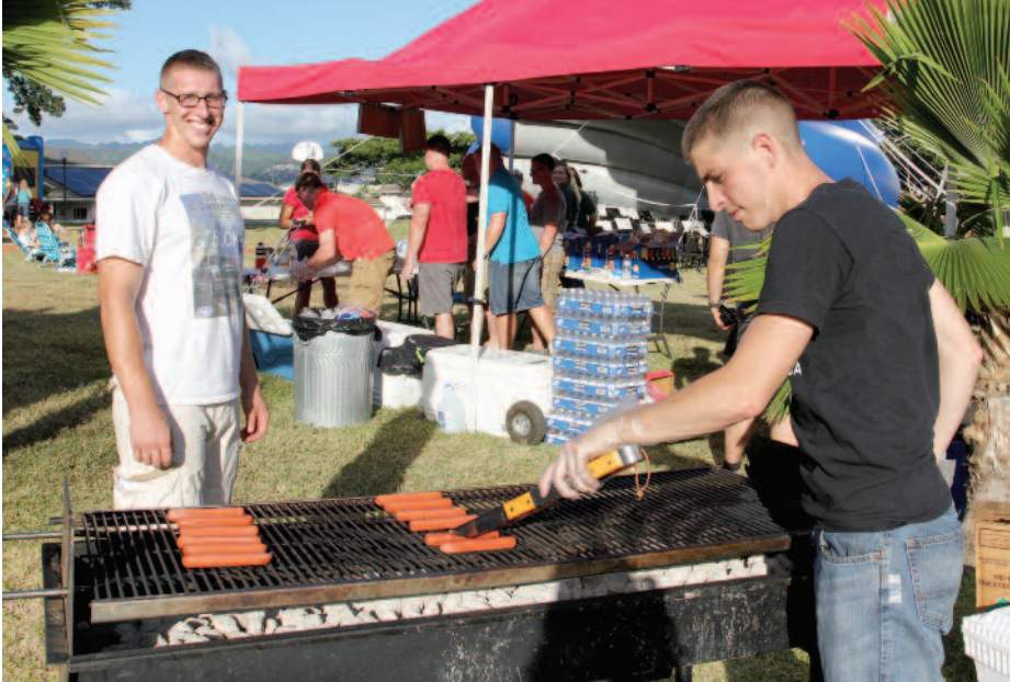
Service members grill up hot dogs for the crowd at a Forest City community event at Manana housing in Pearl City.

This is a great time to kick off the summer season by firing up your grill. Unfortunately, summer is also prime time for grilling-related fires. According to a 2010 report from the Federal Emergency Management Agency (FEMA) and the U.S. Fire Administration, more than half (57 percent) of grill fires on residential properties occur from May to August. So before turning up the heat, it’s a good idea to check out this important safety information. The National Fire Protection Association (NFPA) reports that from 2007-2011 fire departments responded to an average of 8,800 home fires each year that involve grills, hibachis or barbecues. Those fires resulted in an estimated annual average of 10 deaths, 140 injuries and $96 million in property damage. Of those fires, 56 percent started on patios, lanai,