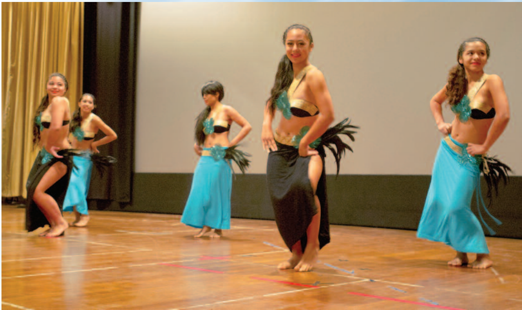
Military members and their families were treated to a traditional Hawaiian hula performance prior to the premier of the movie "Aloha" at the Hickam Memorial Theater at Joint Base Pearl Harbor-Hickam on May 17.