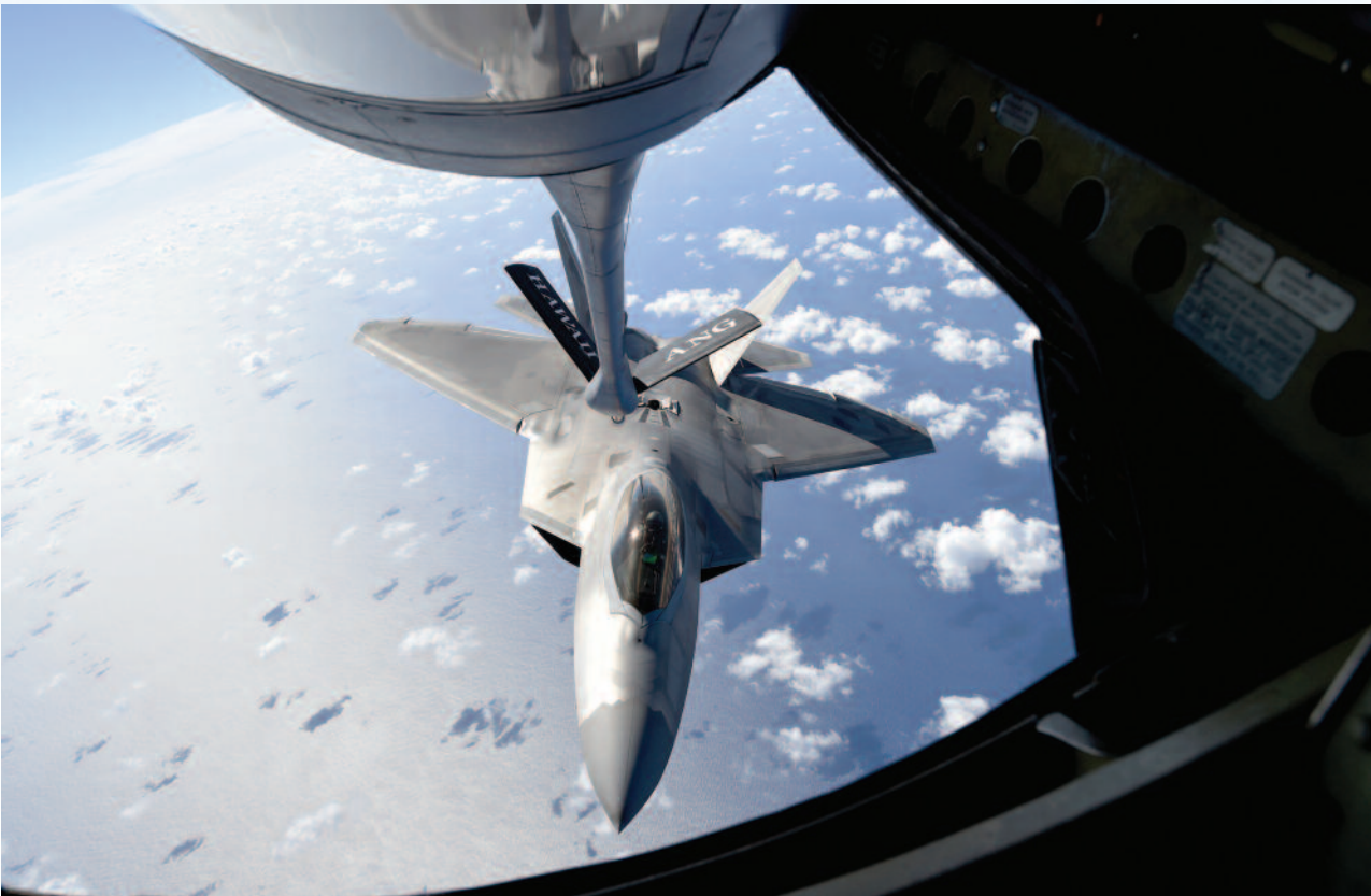
A F-22 Raptor, from the Hawaii Raptors, prepares to receive fuel during an in-air refueling from a KC-135R Stratotanker from the 96th Air Refueling Squadron over Hawaii, May 19. The F-22 is the Air Force's fifth generation fighter aircraft that combination of stealth, supercruise, maneuverability, and integrated avionics, coupled with improved supportability, represents an exponential leap in warfighting capabilities.