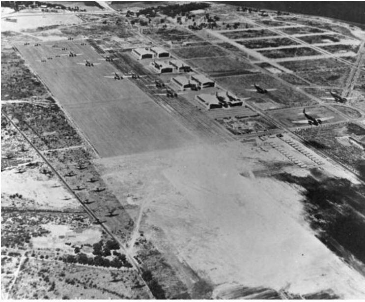
(Above) Aerial photograph of early Hickam Field from June 1938 showing early construction and flying operations.

Between October and December 1935, crews cleared 2,225.46 acres that would be Hickam Field. Early installation of infras-