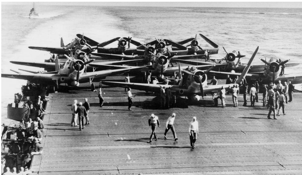
U.S. Navy Douglas TBD-1 Devastators of Torpedo Squadron 6 (VT-6) are seen on the deck of USS Enterprise (CV-6) prior to launching for attack against four Japanese carriers on June 4, 1942 on the first day of the Battle of Midway.