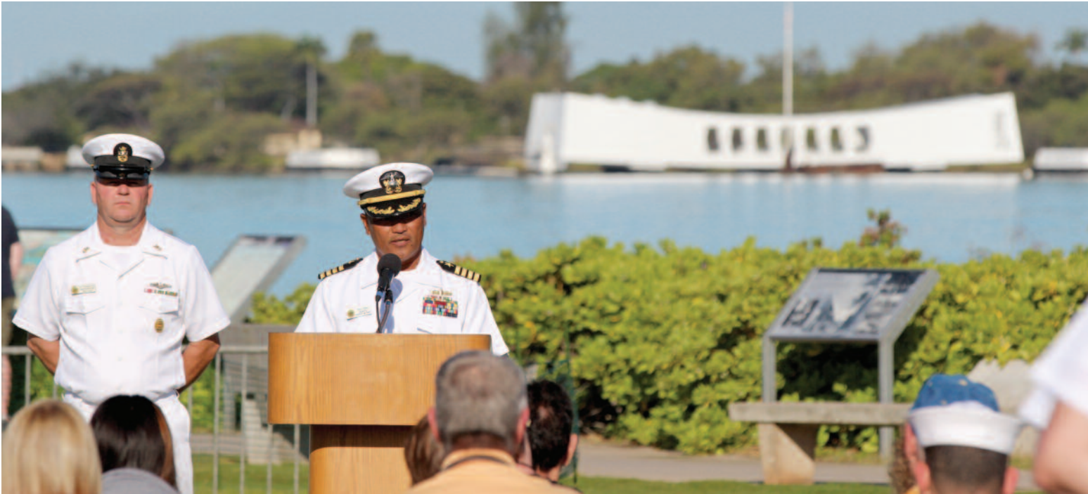
U.S. Navy Capt. Nonito Blas, Pearl Harbor Naval Shipyard & Intermediate Maintenance Facility deputy commander, addresses the audience during the Pearl Harbor Colors ceremony May 21 at the Pearl Harbor Visitor Center. Blas spoke about the 107 years the shipyard kept the fleet 'fit to fight' including emergent repairs on USS Yorktown (CV 10), which enabled the aircraft carrier to participate in the Battle of Midway.

"Though repairs were estimated to take three months, the Navy Yard