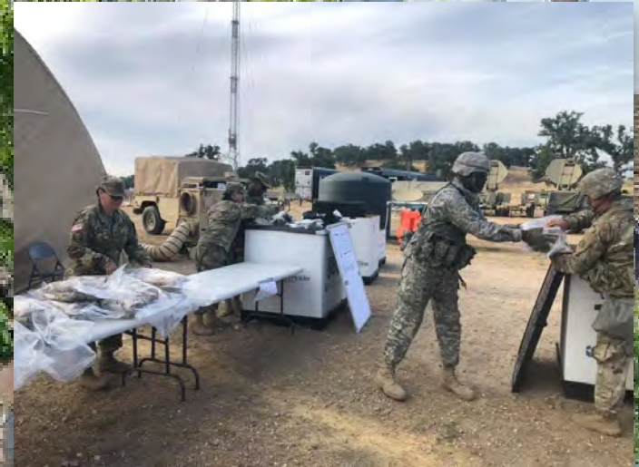
May 14, 2019 Fort Hunter Liggett, California

364th ESC HHC conducted fueling operations during CSTX 91-19-01.