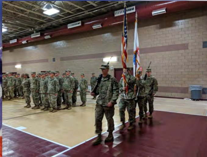
Sept. 8, 2019 Helena, Montana 652 RSG hosts farewell ceremony before deployment to Poland.