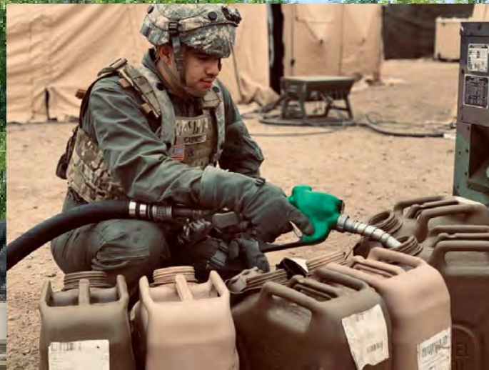
May 14, 2019 Fort Hunter Liggett, California

364th ESC HHC conducted fueling operations during CSTX 91-19-01.