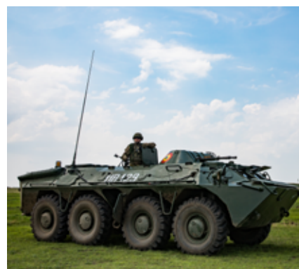
(right) A Romanian soldier with the 631st Tank Battalion mounted in a TAB-77 personnel carrier surveys the area during a force on force exercise as part of Justice Eagle.