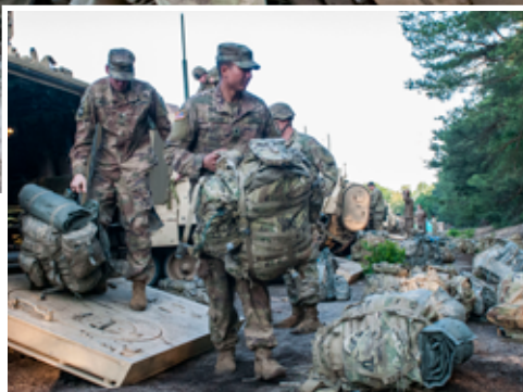
(top) Soldiers of Charlie Company, backup a M3 Bradley that has just been unloaded to a staging area at Camp Karliki, Poland.