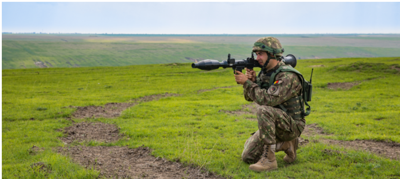
A Romanian soldier with the 631st Tank Battalion aims a simulated rocket launcher at the opposition force during a force on force exercise as part of Justice Eagle on a range near Smardan Training Area, Romania.