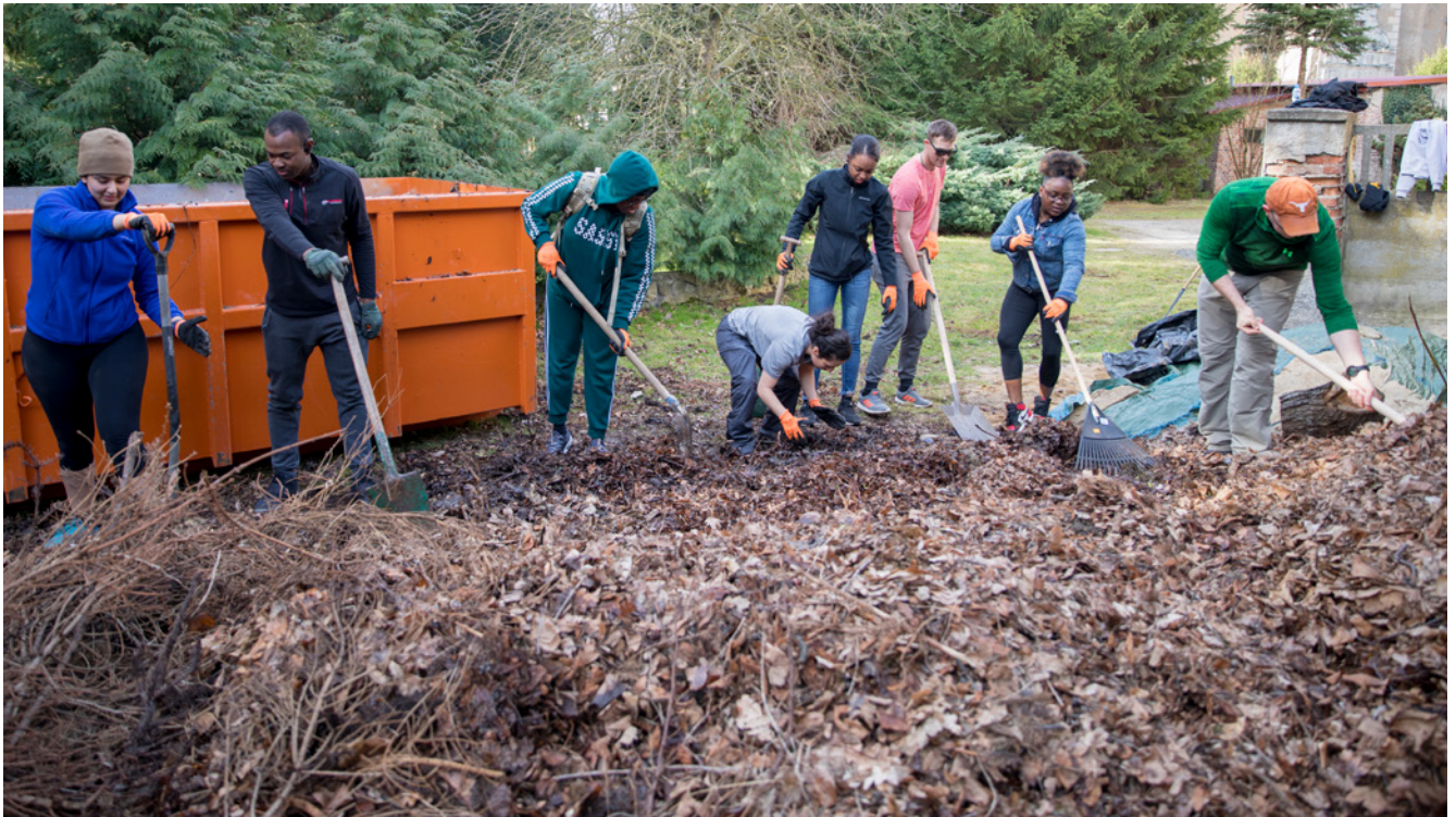
Soldiers provide service to a local church by cleaning up piled leaves and branches.