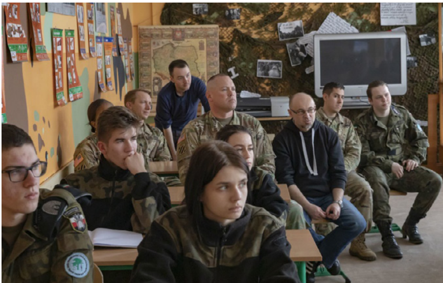
The command team of the 101st BSB, visited the students and faculty of Gorzów campus.