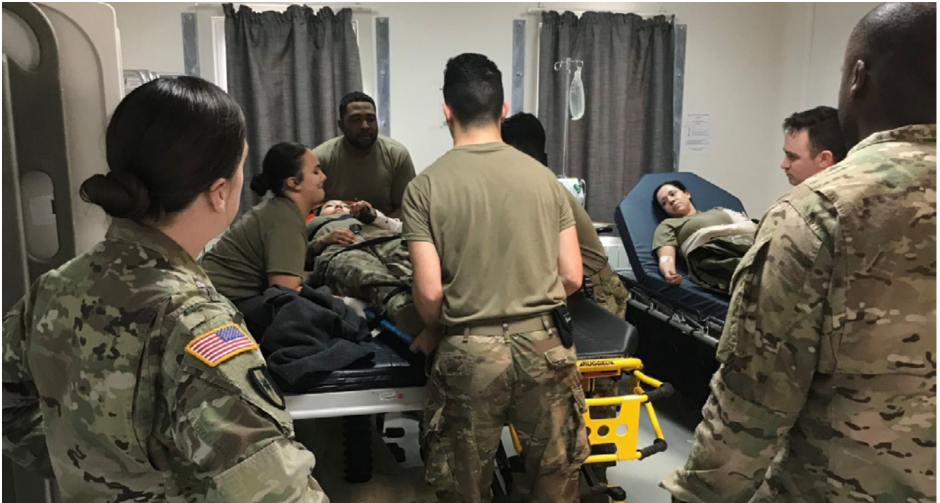
U.S. Army medics prepare a mock casualty for transport to the Air Base during a training exercise held at the Mihail Kogalniceanu Air Base.