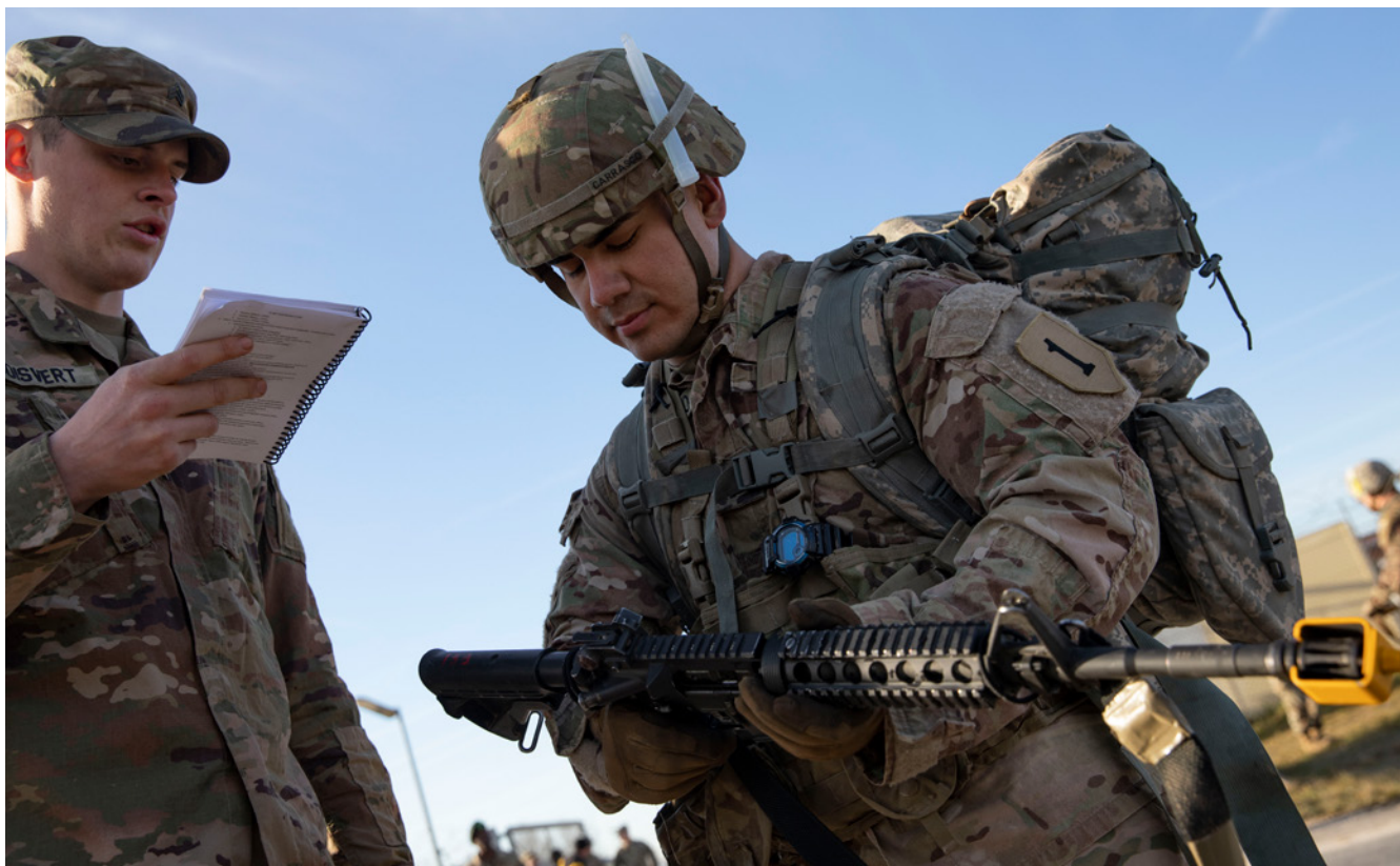
A Soldier from the 1st Armored Brigade Combat Team, 1st Infantry Division, performs a weapons check for a grader as he approaches the finish line of a 12 mile ruck march to qualify for the Expert Infantryman Badge

VILSECK, Germany -- Soldiers from the 1st ABCT, 1st ID, trained and tested for the Expert Infantryman Badge (EIB), at the Vilseck Army Airfield, Germany, March 4-22, 2019.