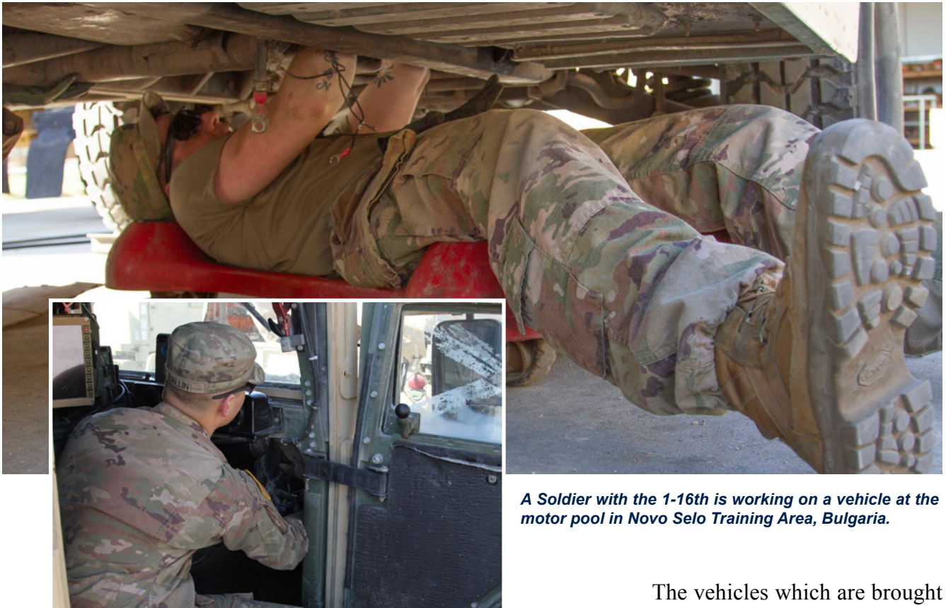
A Soldier with the 1-16th is working on a vehicle at the motor pool in Novo Selo Training Area, Bulgaria.