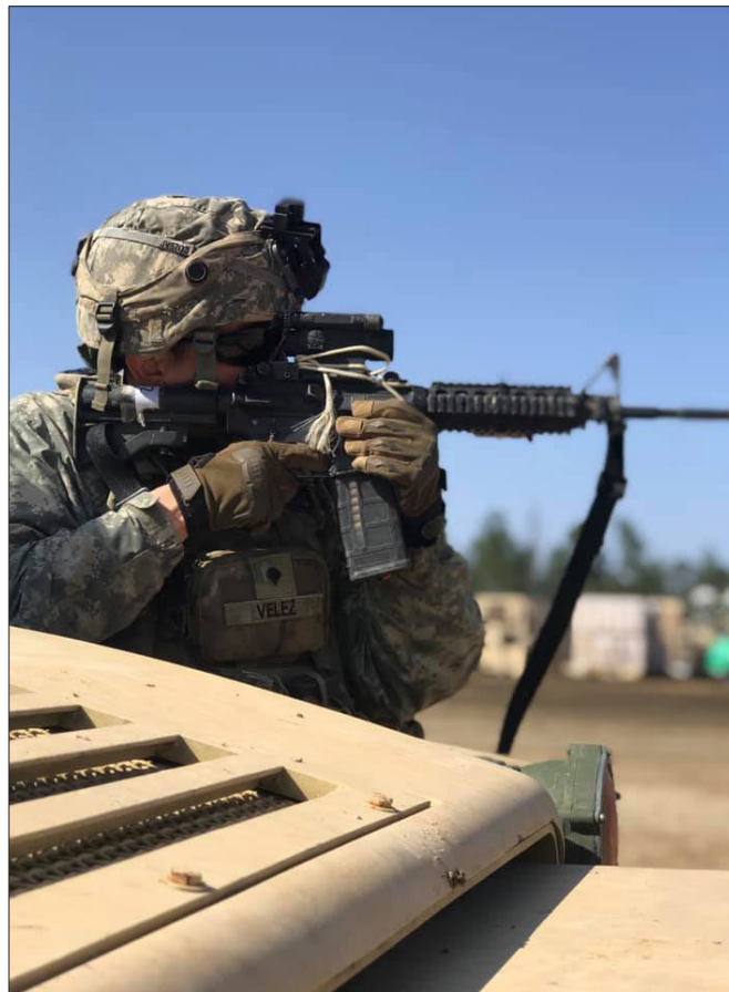
A Soldier from 10th Mountain Division Sustainment Brigade takes up a defensive position during his rotation to the Joint Readiness Center in Fort Polk, Louisiana.