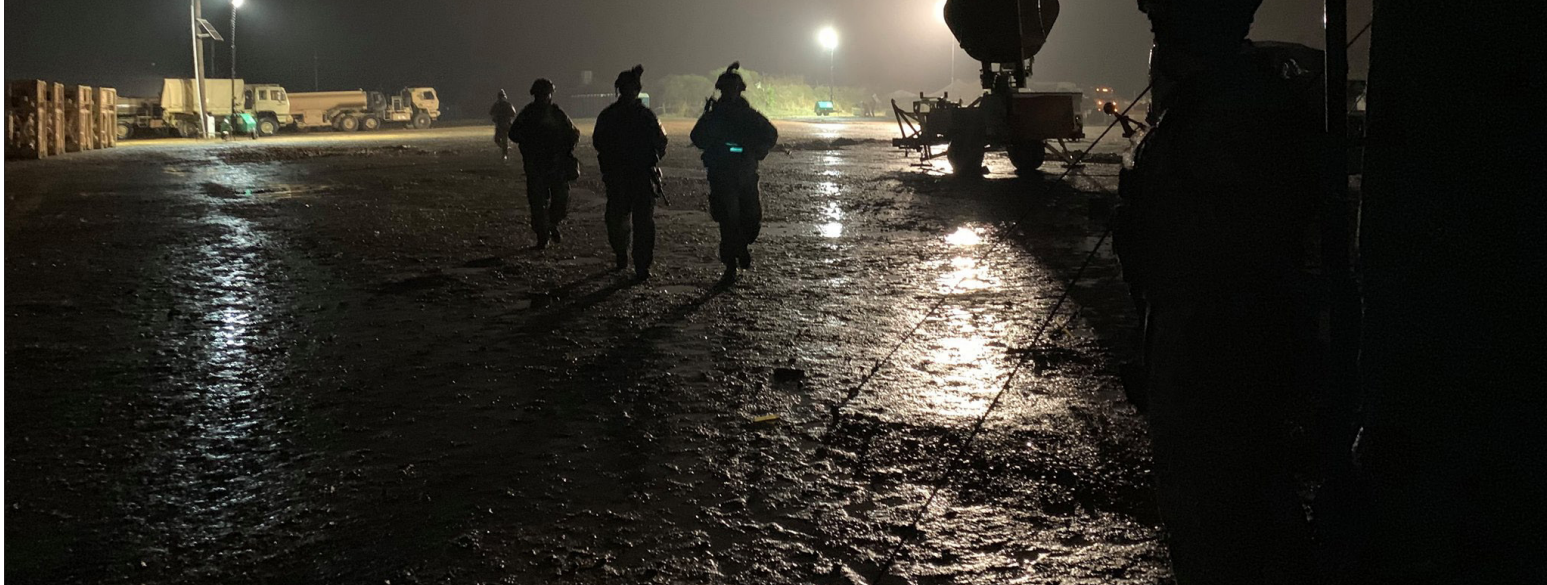
Soldiers from 10th Mountain Division Sustainment Brigade walk across a muddy field during a rotation to the Joint Readiness Center in Fort Polk, Louisiana.