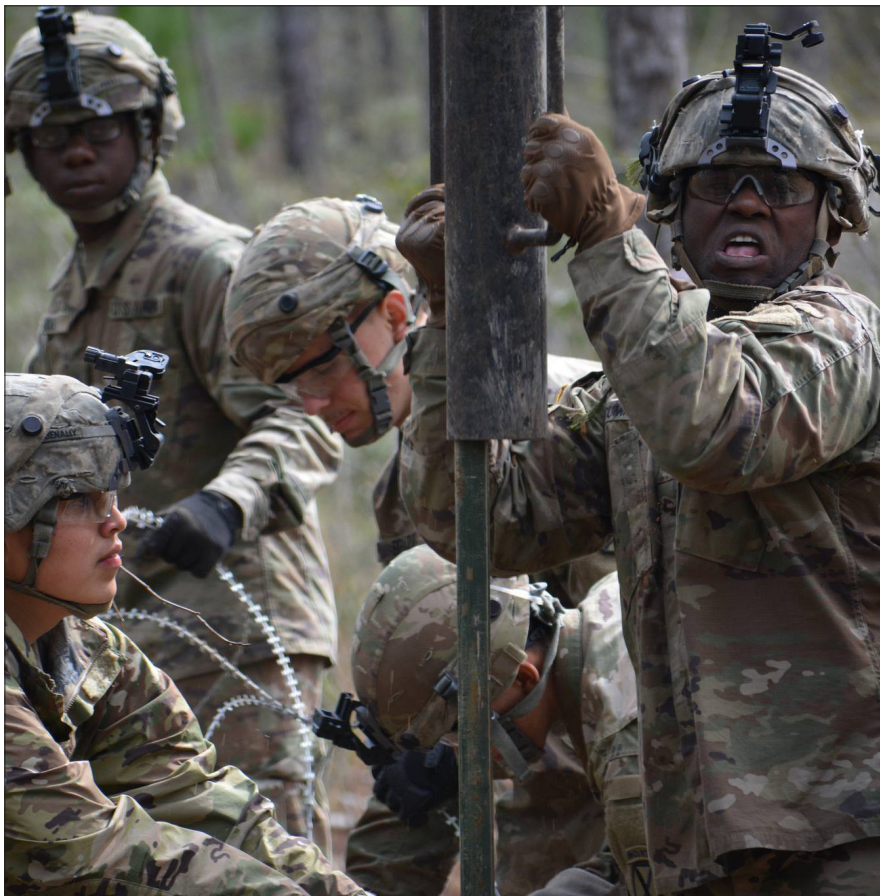
Soldiers from 10th Mountain Division Sustainment Brigade lay concertina wire around their perimeter during a rotation to the Joint Readiness Center in Fort Polk, Louisiana.