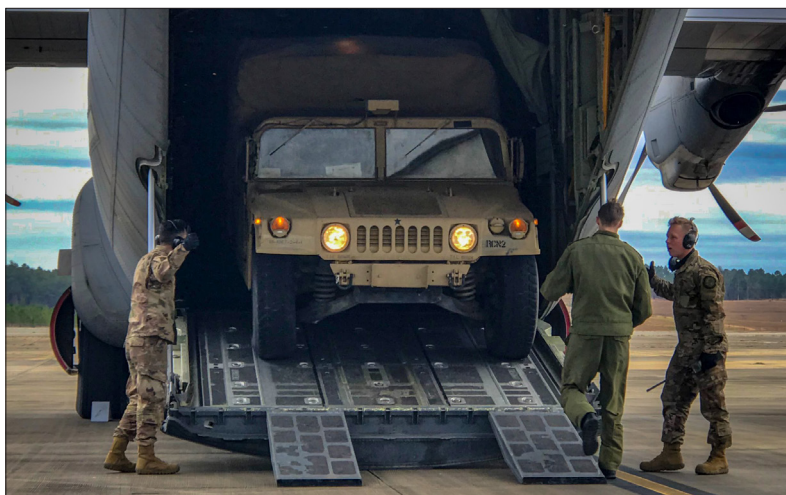
3rd Brigade Combat Team successfully loaded 7 vehicles onto 3 different C-130J Super Hercules planes during Air Land Operations on Feb. 9 at Polk Army Airfield, Louisiana. It was a joint effort between the 383rd Movement Control Team, 1st Battalion, 509th Infantry Regiment, the U.S. Air Force, the Canadian Air Force, and 3rd BCT.