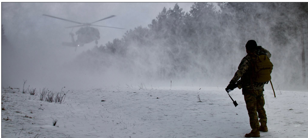
A Soldier from 10th Combat Aviation Brigade guides a helicopter during a survival and recovery exercise to test their evasion and personnel recovery techniques.