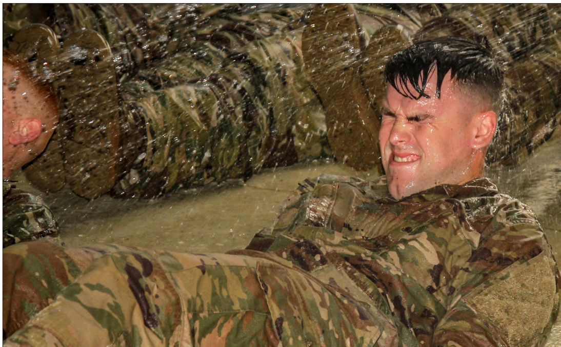
A Soldier from 3rd Brigade Combat Team endures exercise, exhaustion and being sprayed with water during the pre-ranger course at Fort Benning, Georgia.