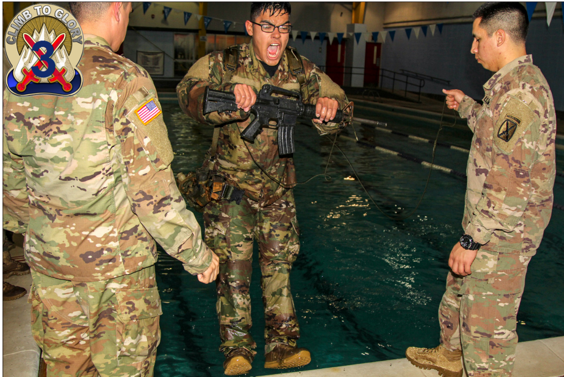
A Soldier from 10th Mountain Division participates in the pre-ranger course in Fort Benning, Georgia. Over 40 Soldiers began the course, but only 15 qualified to attend Ranger School.