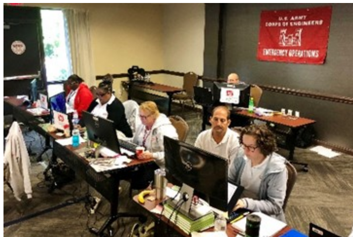
The Crisis Action Team used a conference room at their hotel in Charlotte to provide continuous support.

CAT team moved the alternate EOC Beach to the Deployable Tactical Operations System (DTOS), providing continuous support to the Wilmington District for Recovery Operations and accountability of District Employees. Hurricane Florence created catastrophic damage to the coast and limited access back to Wilmington, and the team continued operations until the routes from Charlotte were safe to travel. Preliminary Damage Assessment (PDA) teams were beginning to assemble to inspect the conditions of the four Coastal Storm Risk Management projects at Wrightsville Beach, Carolina Beach, Kure Beach and Ocean Isle