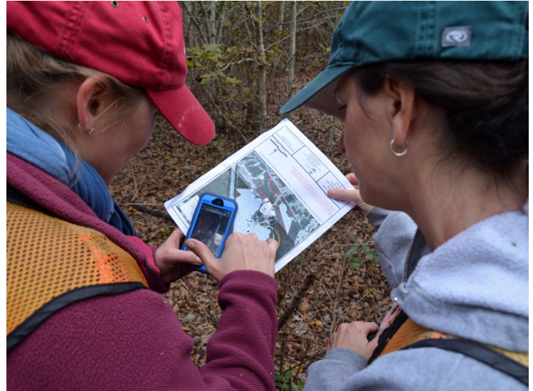
The Regulatory Branch completed 1200 jurisdictional determinations and more than 1,000 pre-application consultations.

He said that the dams generated over $2-million, and more than seven million visitors took advantage of recreational opportunities. “We issued over 1800 Every Kid in the