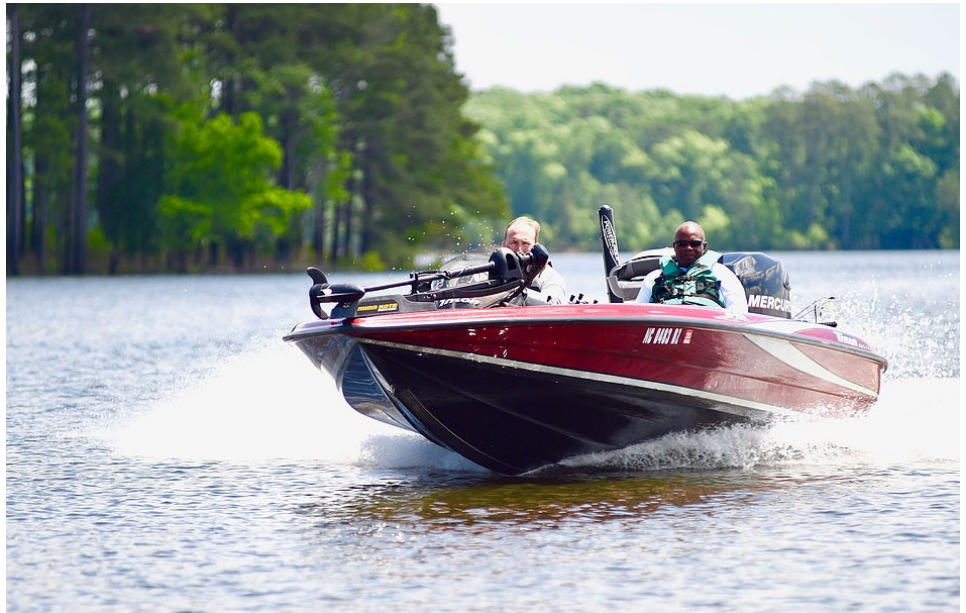
Jordan Lake has been the chosen site for the annual fishing tournament.