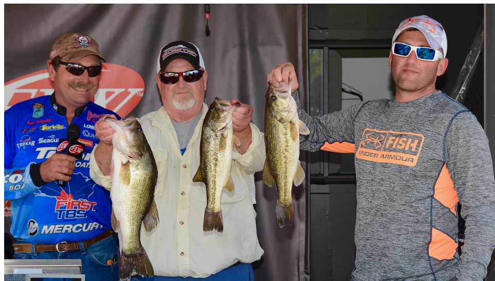
Volunteers are key to successful fishing tournaments because of their dedication to service members.