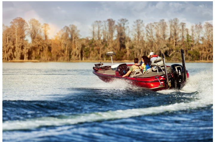
Volunteers are key to successful fishing tournaments because of their dedication to service members.

"I'm proactive in the summertime when I'm patrolling beach areas," he said. "I pass out water safety pamphlets and tell parents to pay close attention to their children, even if they're in shallow water. And not to scare them, but also explain to the