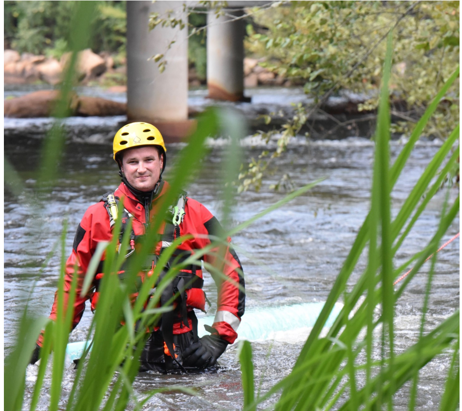
During Hurricane Florence, Swift Water Rescue Team members went into action to assist people who were in danger.