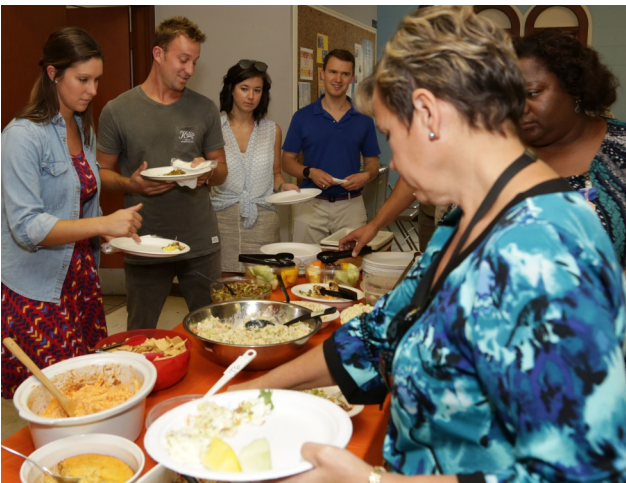
Employees help themselves to a delicious meal with various foods supplied by volunteers and organized by the Recreation Committee.