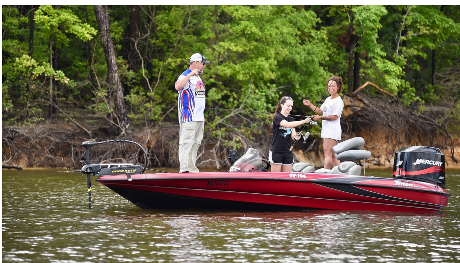
Two Fort Bragg Soldiers, right, try a semi-secluded spot to fish with a volunteer.

“I want to grow it because we have been asked numerous time to expand to other states from New York to Pennsylvania to Virginia, and to South Carolina,” he said. “But due to us being all volunteers and most having jobs, it would be hard to expand to other states. Bringing in other activities is always welcome, and this year we had a fund raiser to send a hunter to Michigan for a deer hunting trip.”