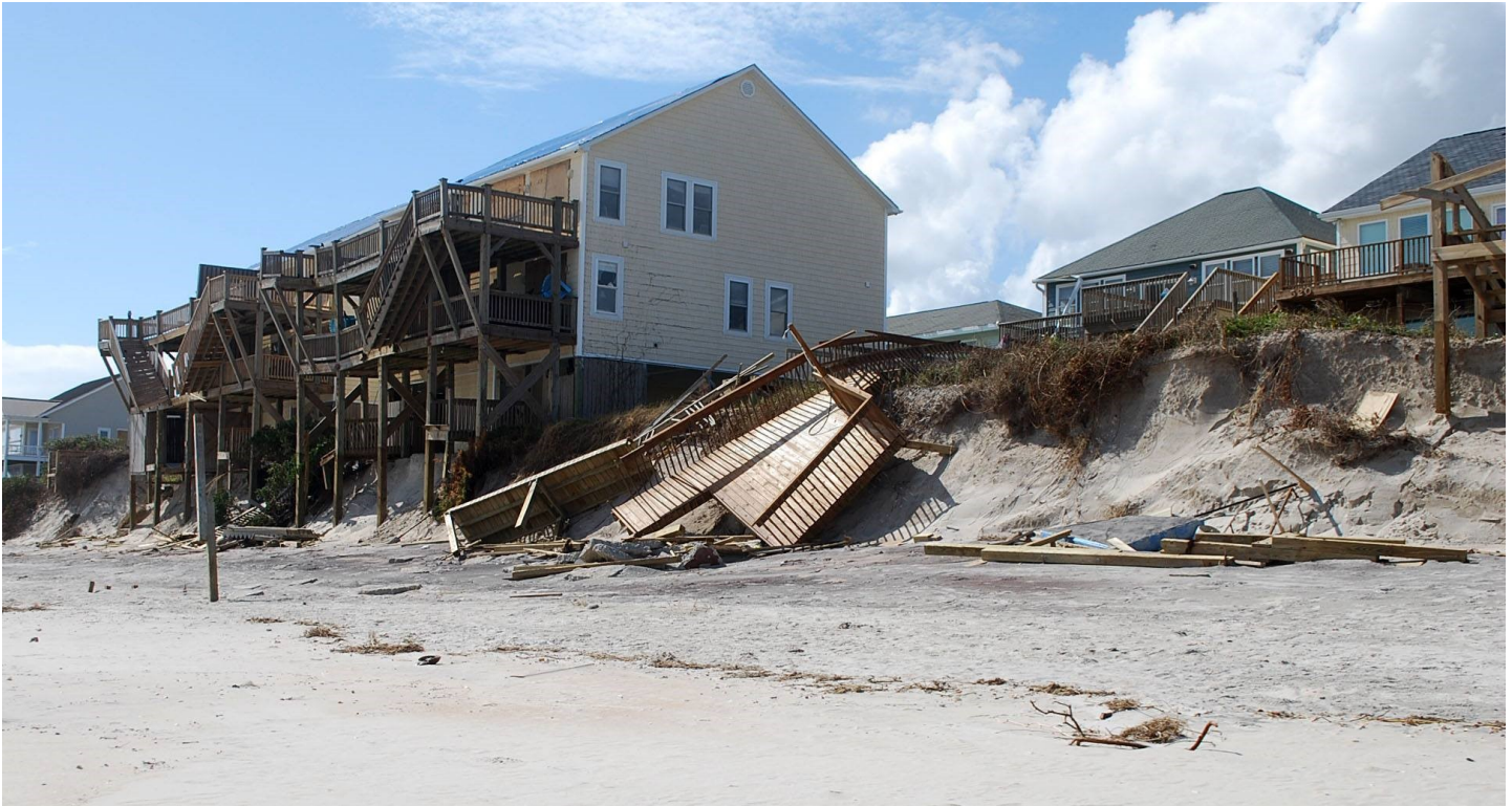
Homes were heavily damaged and many dunes failed at Surf City, North Carolina.

trees, flooding and assorted vegetation overwhelmed numerous areas of the state causing additional flooding and road closures. Mavis said that the Wilmington District provided technical assistance to FEMA for the debris mission by providing mission analysis and field assessments that were reported back to FEMA debris officials.