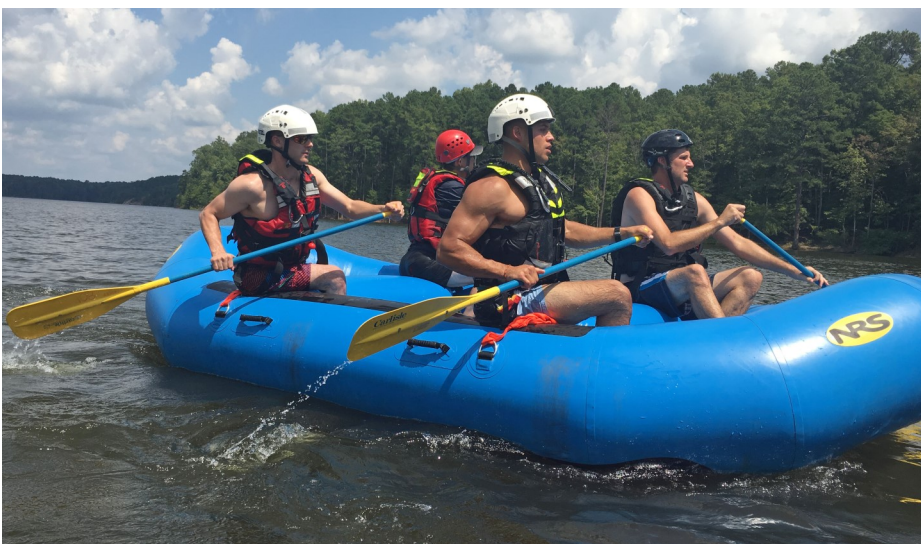
Swift Water Rescue Team members train throughout the year to maintain their proficiency in search and rescue tactics.

The Wilmington District is eager to offer its facilities to local, state and other federal agencies for training. U.S.