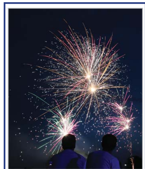
There will be fireworks in Schinnen and on SHAPE (Archive photo).

Volunteers are still needed to assist with the celebration on SHAPE July 1. There are multiple opportunities over the course of several days to help out. If you're interested, you can register online.