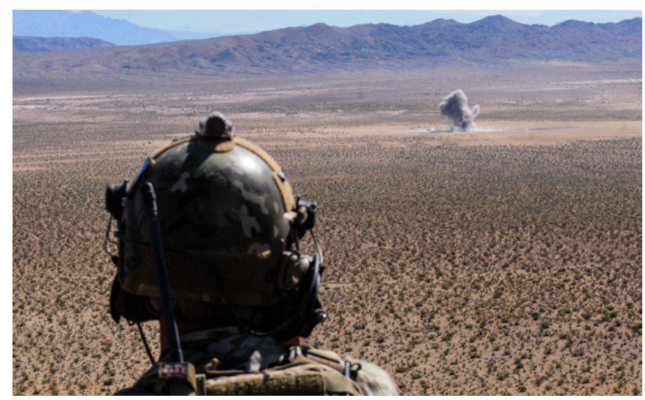
An Airman of the 238th Air Support Operations Squadron, Mississippi Air National Guard, watches as a Mark-82 high explosive bomb explodes on a marked target during a close air support, live fire exercise June 6, 2017 at the National Training Center.

Fort Irwin, California – The 238th Air Support Operations Squadron, Mississippi Air National Guard, is conducting close air support at the National Training Center during the 155th Armored Brigade Combat Team's rotation.