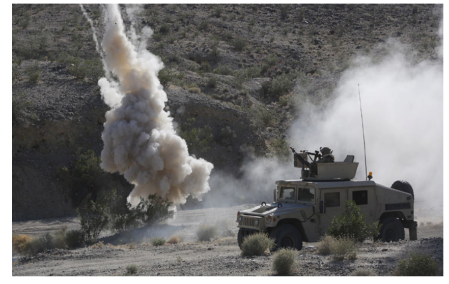
Top: U.S. Army Soldiers assigned to 155th Brigade Combat Team, Mississippi Army National Guard, react to a simulated ambush during Decisive Action Rotation 17-07 at the National Training Center in Fort Irwin, Calif., June 5, 2017.

Left: An M18 Claymore mine is detonated by a Soldier of the 106th Support Battalion, Mississippi Army National Guard, during a live fire exercise June 8, 2017, at the National Training Center.