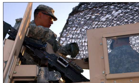
Silver Lions are prepping vehicles, equipment and personnel before beginning operations in Iraq.