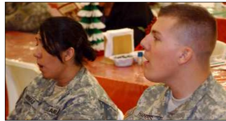
Soldiers celebrated the holiday season by joining together to sing seasonal songs readings from the Bible.