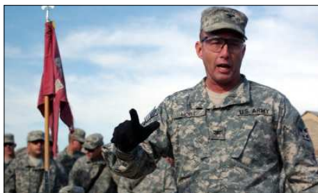
Striker 6 talked to Soldiers on Camp Taji about living conditions as well as the mission ahead.