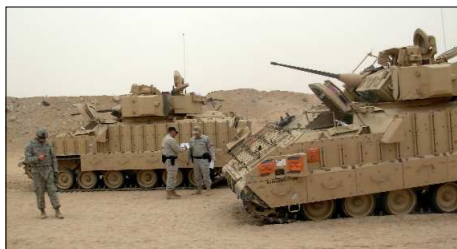
Safety, even in a combat zone, remains a paramount concern.