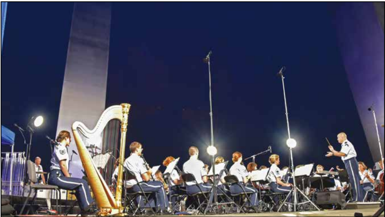
The Air Force band puts on its final concert of this year's Summer Concert Series to the public at the Air Force Memorial, Sept 2. The band put on 64 concerts and reached almost 50,000 people throughout the capital region.

The United States Air Force band wrapped up its Summer Concert Series, Sept. 2, at the Air Force Memorial in Arlington. The band put on a total of 64 concerts between Memorial Day and Labor Day at five primary locations throughout the National Capital Region which were: The Air Force Memorial, The U.S. Capital steps, National Harbor, and the Smithsonian's Air and Space and History Museums. The events featured The Concert Band, The Singing Sergeants, The Airmen of Note, The Symphony Orchestra, and the Strolling Strings. Max Impact, the band's rock ensemble, which normally is included in the Summer Concert Series, was unable to participate, because they were deployed overseas. However, they did put on 53 performances for about 17,100 coalition troops and international audiences in that 90-day deployment. According to the Commander of the Air Force Band, Col. Larry Lang, the band was able to entertain and be good military ambassadors to tens of thousands of people throughout the summer series. "We reached about 49,000 people over the summer," Lang said. "Each of our local summer venues all had enthusiastic audiences that loved seeing the band perform." Lang said due to the popularity of the series at the Air Force Memorial, next year will offer some exciting new additions to the venue. "One change we are excited about for the Air Force Memorial concerts is the Under Secretary of the Air Force will be hosting