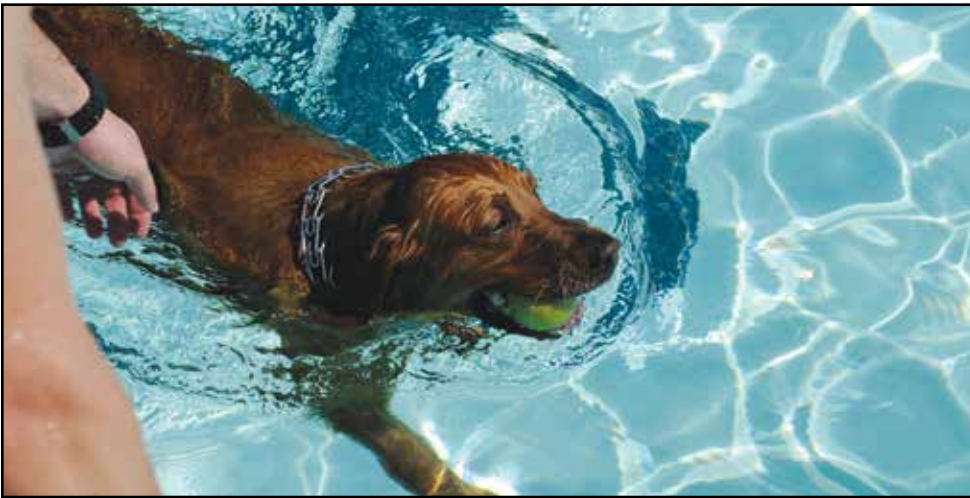
U.S. NAVY FILE PHOTO

By Scott Pauley Joint Base Anacostia-Bolling Public Affairs