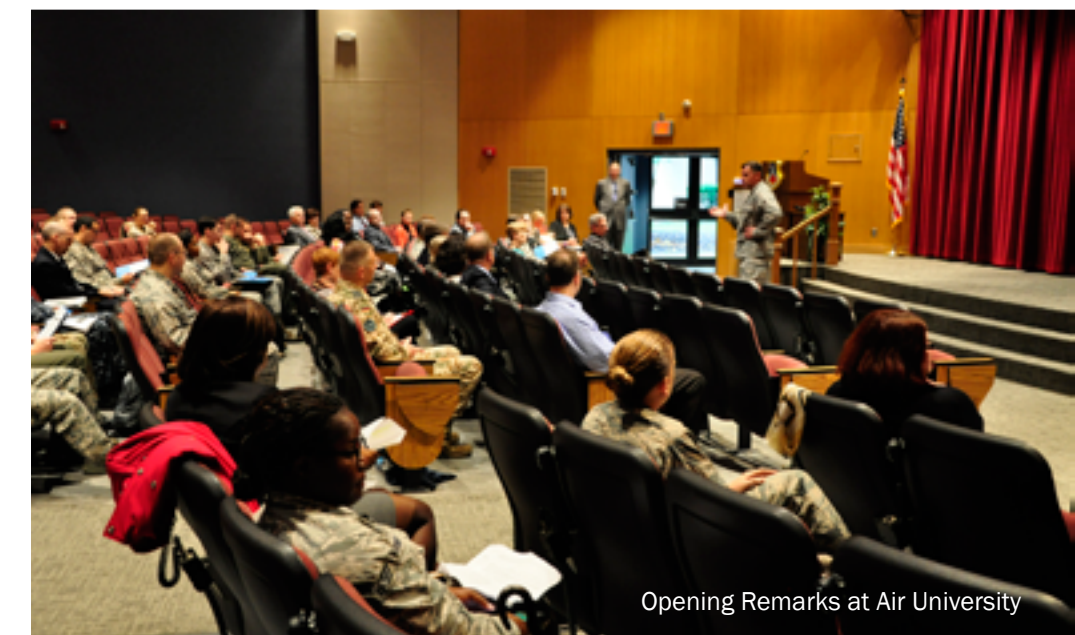
Opening Remarks at Air University