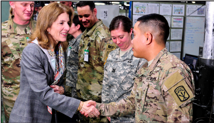
(Top) United States Ambassador to Japan Caroline Kennedy meets Soldiers from the 593rd Expeditionary Sustainment Command at Camp Itami, Japan Dec. 9.