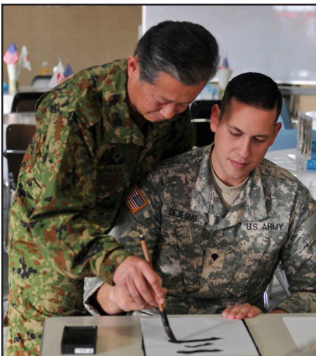
U.S. Army Soldiers and Japan Ground Self-Defense Forces work side-by-side during Yama Sakura 69. Building stronger partnerships starts with working together, and extends to understanding each others' culture in order to build trust and friendship.