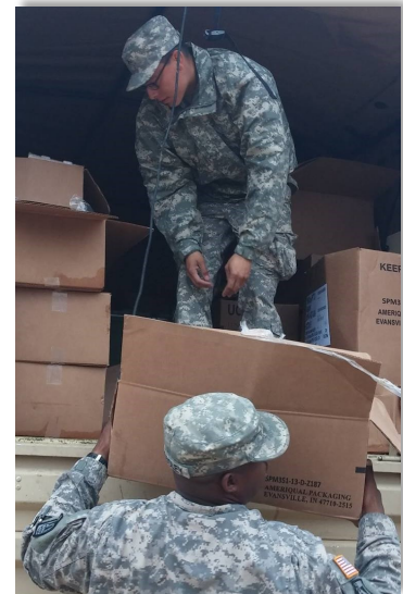
Company Food Service team downloading hot chow