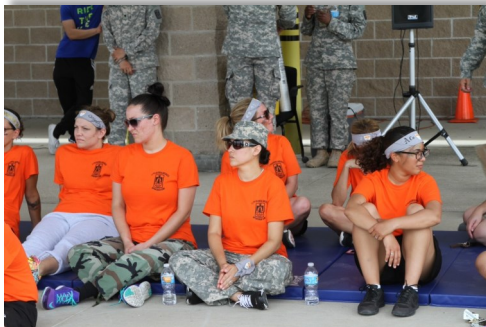
TITAN Spouse's Preparing for the PT Test