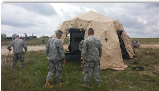
Constructing the Company Headquarters tent