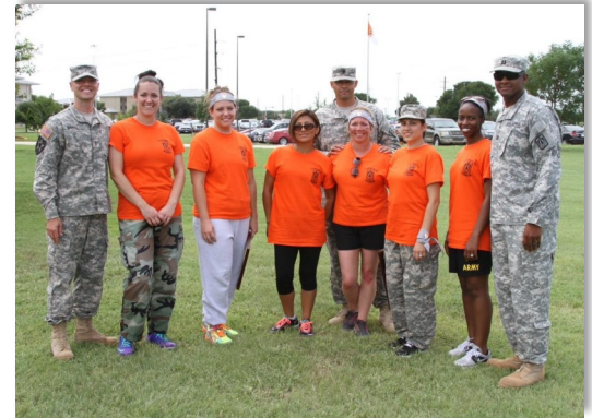
TITAN Spouse's at the conclusion of the Boot Camp