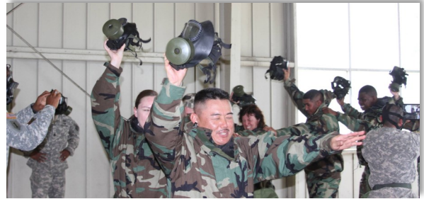
TITAN Soldiers in the CS Chamber

On Tuesday, 31 March 2015, TITAN Company Soldier's participated in a CS Chamber training exercise. This training opportunity was important because many of the Soldier's haven't conducted CBRN-related training since initial entry training. The chamber can be intimidating to some, but all TITAN Soldier's completed the training, with some going through twice! Great job TITANS !