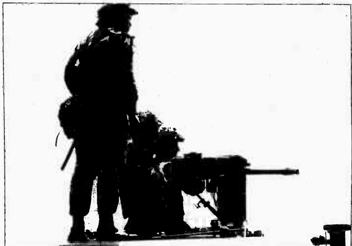
Grenade power — Marines from Headquarters and Service Company 3d Battalion, 3d Marine Regiment, feel the power of firing a MK-19, 40mm grenade launcher during an exercise at Camp Fuji, Japan.