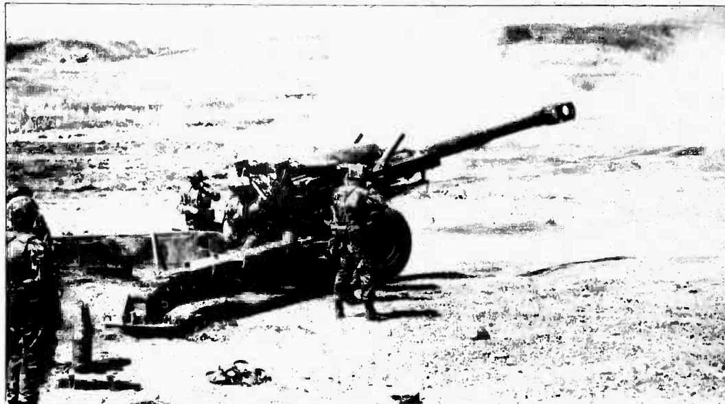
Fire exercise — A gun section from Charlie Battery, 1st Battalion, 12th Marine Regiment, blasts a round downrange during an indirect fire exercise at Camp Fuji, Japan.