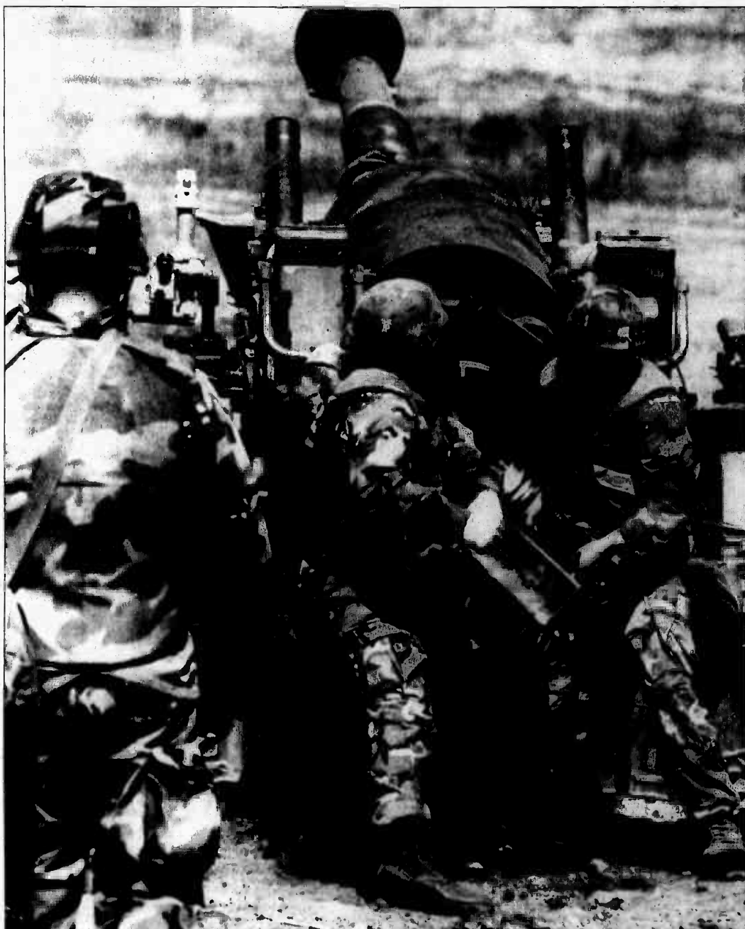
Big boom! — Marines from Charlie Battery, 1st Battalion, 12th Marine Regiment, shove a round into the M-198, 155mm howitzer during an indirect fire exercise at Camp Fuji, Japan.