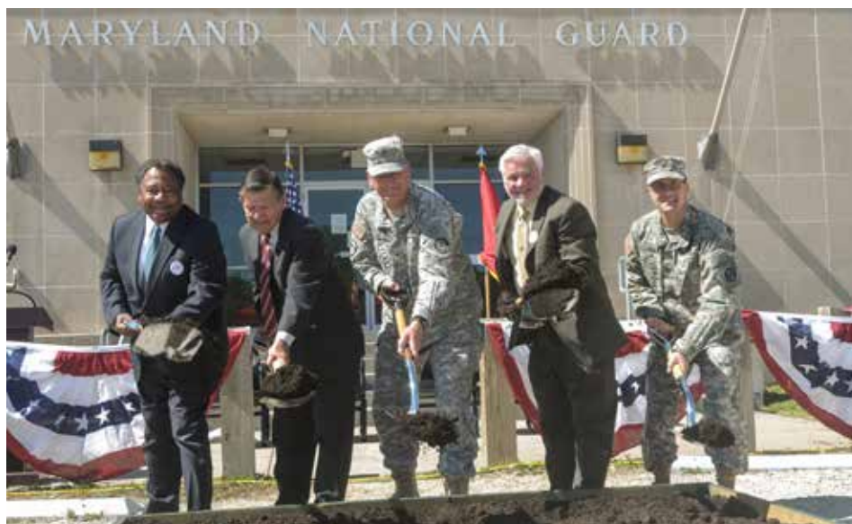
The Maryland Army National Guard broke ground on a project to renovate and expand the Command Sergeant Major Jerome Grollman Readiness Center in Dundalk, Md., May 2, 2013.

The Maryland Army National Guard broke ground on a $9.28 million project to build a new Brigadier General William Smallwood Readiness Center to replace the existing 1950s facility in La Plata, Md., April 24, 2013.