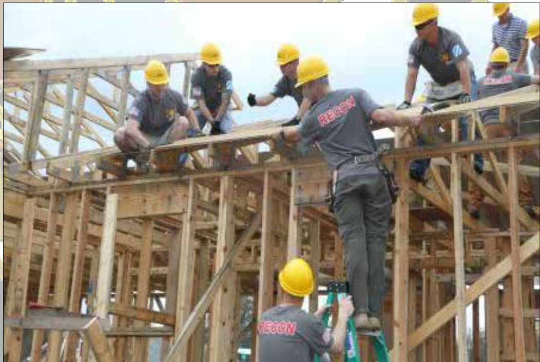
Soldiers assigned to 3rd Squadron, 1st Cavalry Regiment, 3rd Armored Brigade Combat Team, 3rd Infantry Division nail down the top of the roof during their 'day of service' with Habitat for Humanity, Columbus, Ga., Dec. 6. In addition to helping others, community service gives Soldiers a chance to enhance team building skills.

Today, Habitat has helped build or repair more than 800,000 houses and served more than 4 million people around the world. Their mission is seeking to put God's love into action. Habitat for Humanity brings people together to build homes, communities and hope.