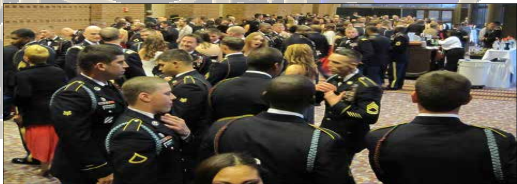
The social hour was alive with fellowship before the Dragon Ball. Professional pictures and various drinks were available to all 1-15 IN Soldiers and their dates to kick off the evening's events.

1-15 IN would like to recognize the "Can Do" spouses and all the Soldiers involved in planning, coordinating, and executing a very successful Dragon Ball. When told to relax, kick back, and have a good time the Soldiers of 1-15 IN naturally have one reply..."CAN DO!"