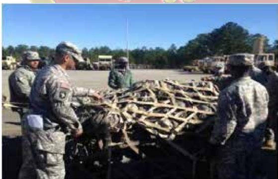
First Lt. Centeio of Golf Battery, 1st Battalion, 10th Field Artillery Regiment, conducts a joint inspection with Air Force loadmasters of a baggage pallet during the Dec. 11 EDRE.

All told, each unit managed to alert, assemble, and arrive at the airfield ready to board departing aircraft in less than seven and a half hours.