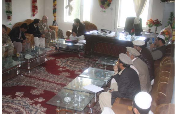
DAIL staff and AG section meeting in the DAIL's office for the last time.