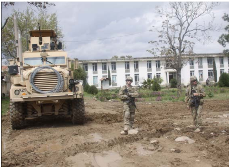
Soldiers of 1st PLT Angel Co 3-187 IN assigned to PRT Khost enjoying the mud after a rare two days of rain during the last visit to the DAIL's office.