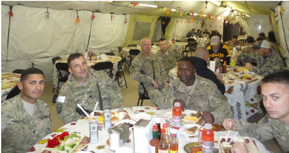
(Above) Headquarters 427th Brigade Support Battalion Soldiers enjoy Thanksgiving dinner together at Forward Operating Base Shank.