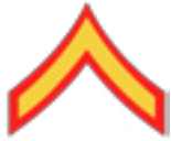
Private First Class