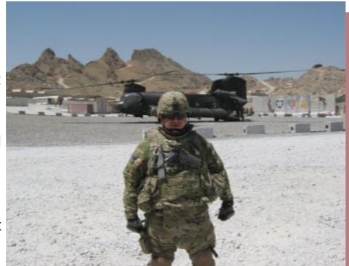
CSM Cervantes at FOB Masum Ghar