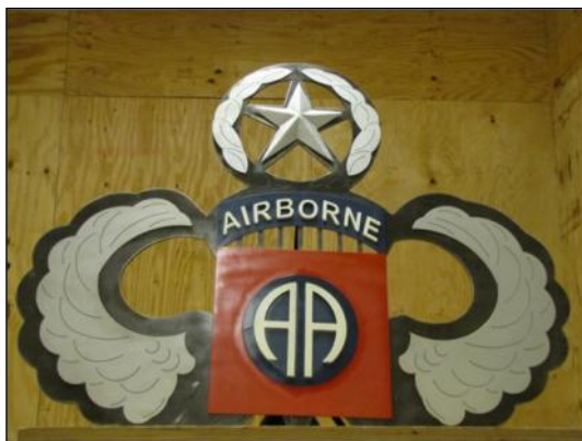
The flag stand built for the 82nd Airborne Division

This month's focus is on our Welders and Allied Tradesmen of the Service and Recovery Section. The five Soldiers in the section are SSG Naber, SGT Duran, SGT McConnell, SPC Hopkins, and SPC Spiritosanto. They have been working every day on special projects that have vital importance to the Frontline mission. Through these dog days of Summer, they have worked without air conditioning in temperatures often exceeding 100 degrees! These guys have true dedication to the mission