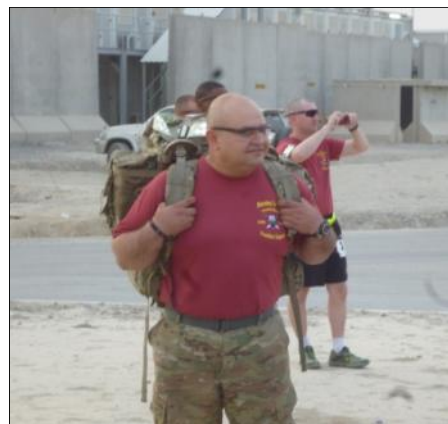
CSM Cervantes getting ready to ruck the event