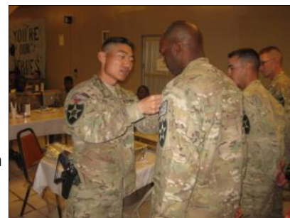
Frontline 6 awarding AAMs to Soldiers of the 1-37FA FLE at FOB Lagman