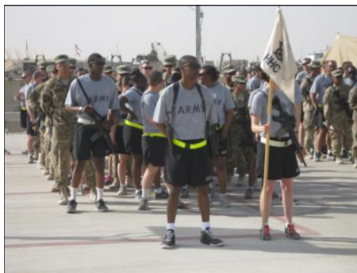
Hazard 7 with the company on the 4th of July

Despite this reorganization, the staff is still meeting all guidance and performing above the standard ensuring that the company's missions, from maintenance to convoys, are fully supported.