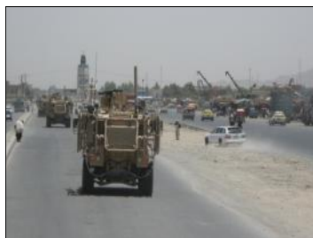
A Frontline convoy in Kandahar City

296th BSB may be headquartered at Kandahar Airfield, but there are Frontline Soldiers all over Combined Taskforce Arrowhead (CTFAH). Some serve on Forward Logistics Elements (FLEs), units comprised of maintenance, distribution, medical and field feeding sections, while others, often cooks, work in one or two man teams to support a small Forward Operation Base (FOB) or Combat Outpost (COP). They may lack easy access to internet or phone for a call home, air conditioning on the hottest of days, or a mattress upon which to sleep, all things readily accessible to those posted at KAF.