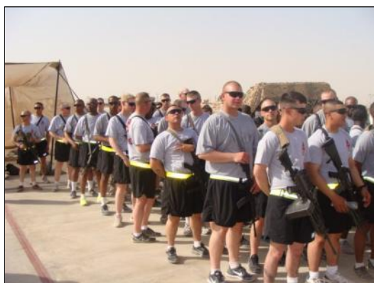
Black Knights in formation before the 4th of July festivities