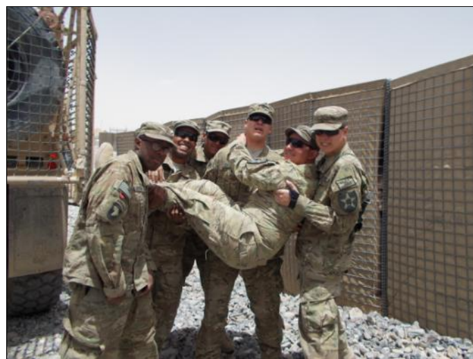
Soldiers pose before going on a mission.