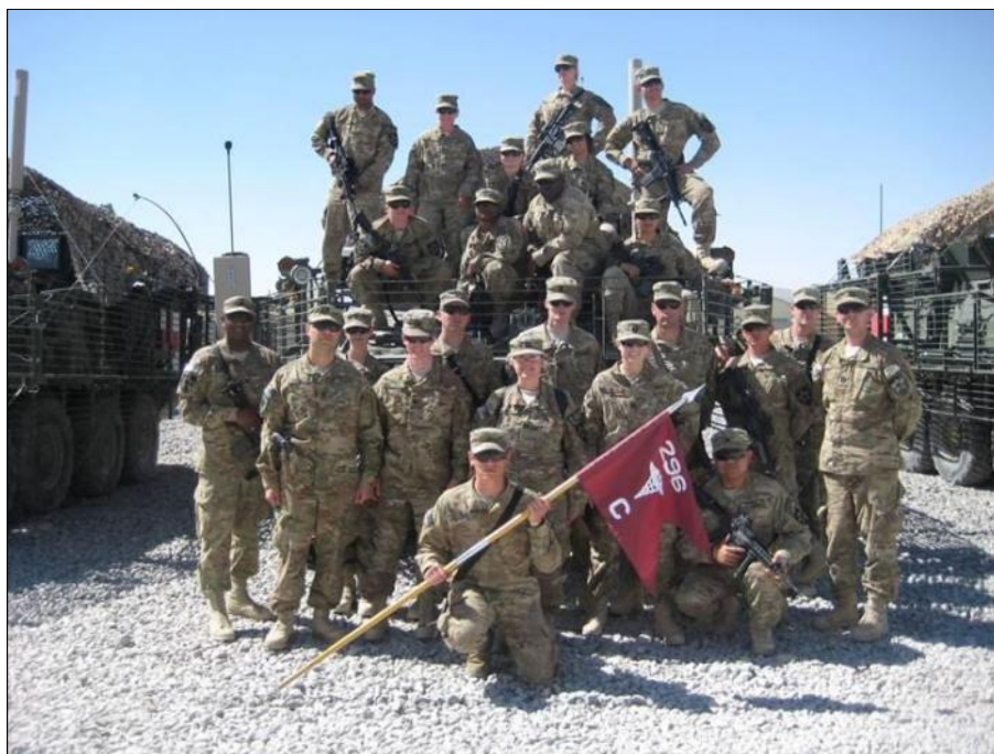
The medics, providers, and command team of Cheyenne Company at Kandahar Airfield