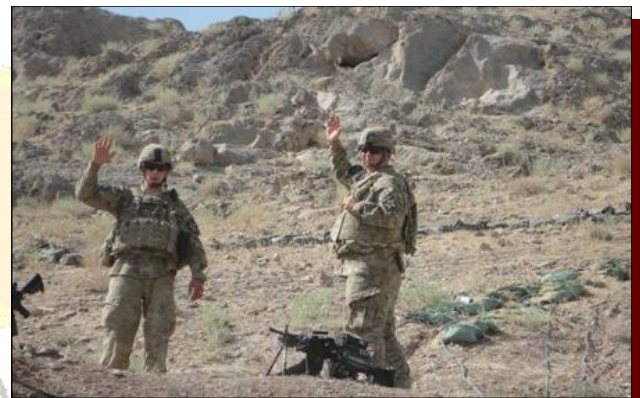
SPC BG and PFC Kenady preparing to set up a radio antenna