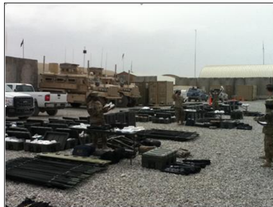
Cheyenne Company conducting inventories and identifying excess equipment

until we redeploy, as this process is critical to help the Army prepare for the reduction of forces and equipment across Afghanistan and the successful handover of the mission to C CO, 702 nd BSB.