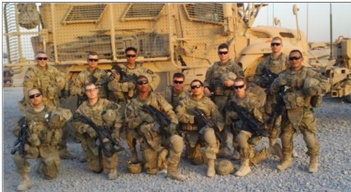
Frontline Support 1 Soldiers in the motor pool prior to a mission