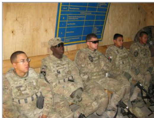
Frontline Support 4 receiving a convoy brief