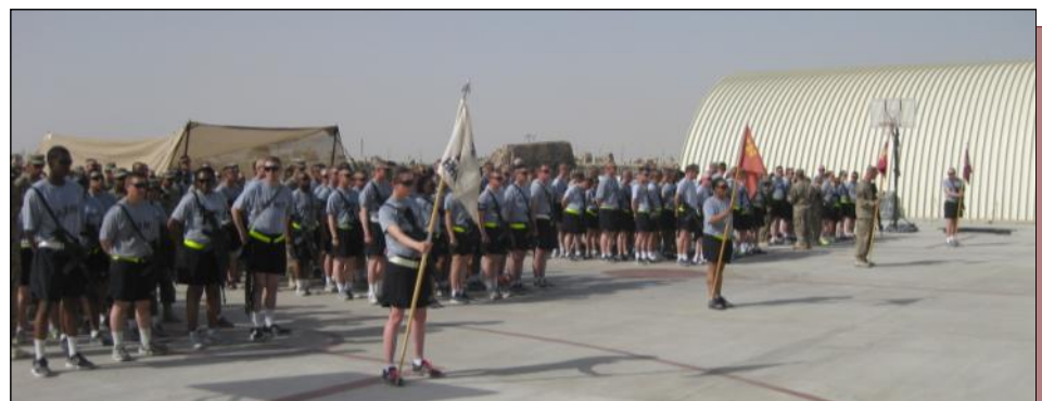
The 4th of July Frontline formation

Finally, and most importantly, July denotes the fourth month deployed for the battalion. Over the past several months, Soldiers have received an enormous amount of support from their families, friends, and the Family Readiness Groups, keeping their morale high. As we near the halfway mark of our time downrange, I ask for your continued support of the Soldiers and Frontline Battalion.