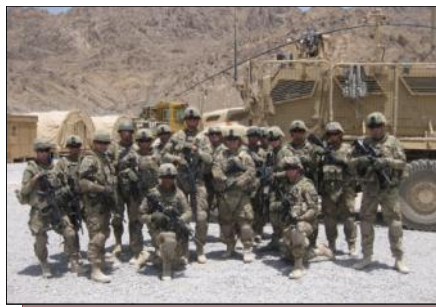
Frontline Support 1 and Frontline 6 at FOB Luke