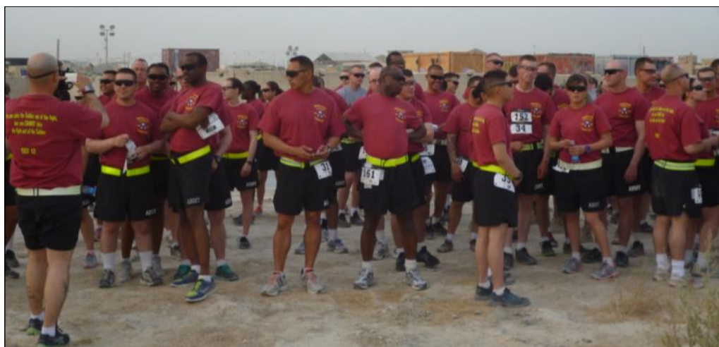
The competitors assembling moments before the race began