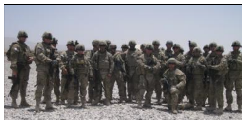
Frontline Support 2 and Frontline 6 at FOB Lagman