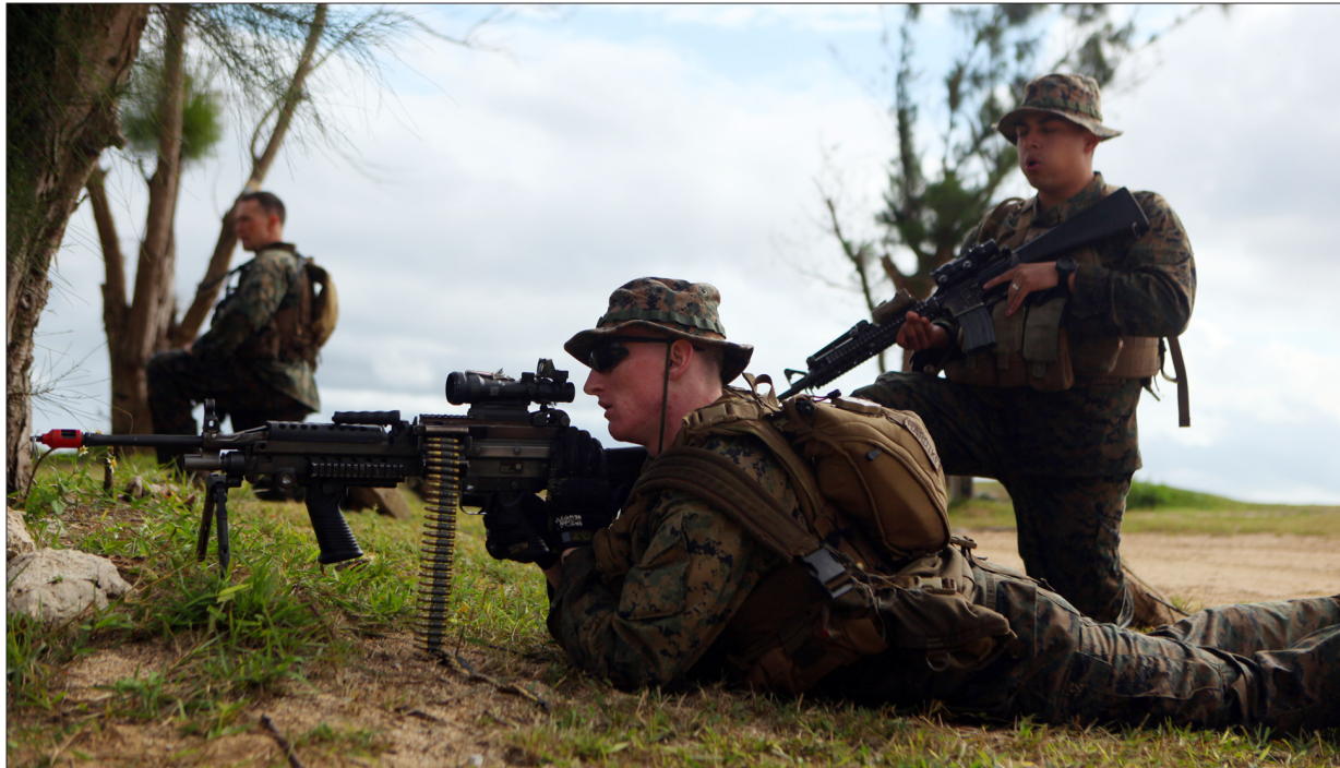
Marines with A Company secure the landing zone during a small boat raid training.