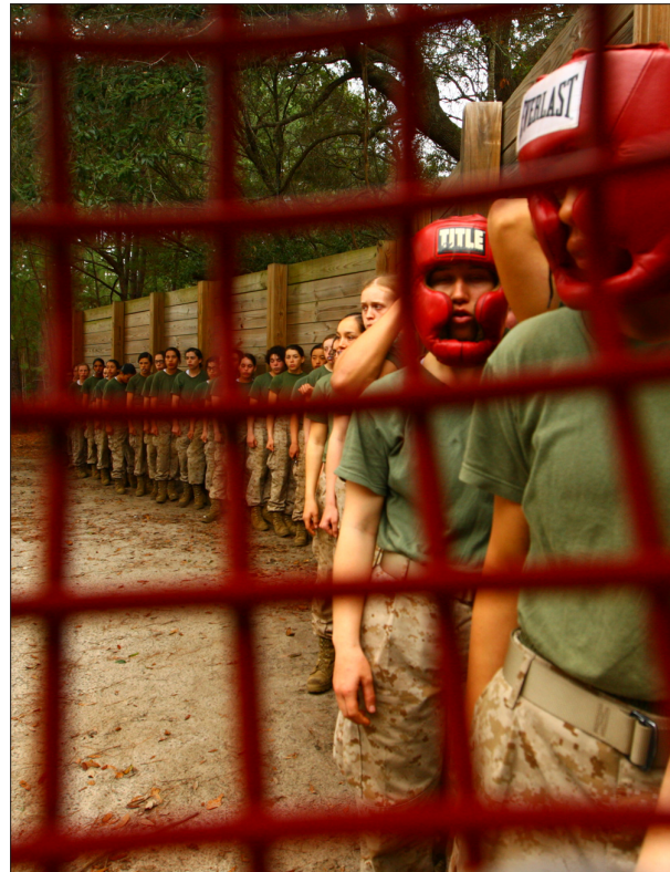
Recruits from Oscar Company, 4th Recruit Training Battalion, stand in line, waiting for their turn at boxing in the "Octagon."