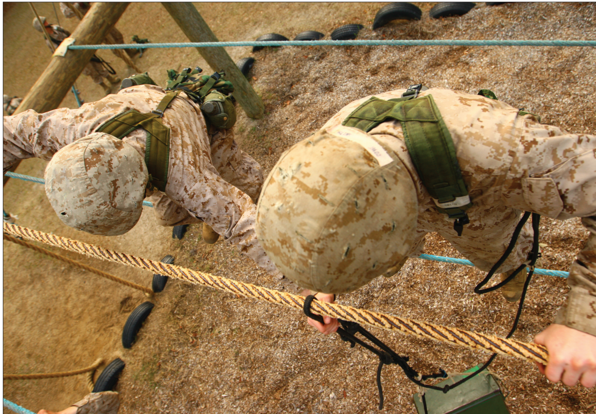
Recruits from Golf Company, 2nd Recruit Training Battalion, maneuver their way across a rope bridge while transporting special gear needed for the mission. The recruits, in day two of the Crucible, fight through food and sleep deprivation to push toward their goal of earning the title of Marine.