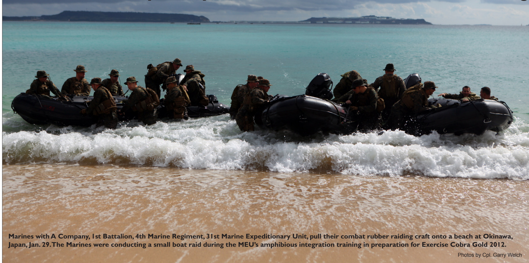
Marines with A Company, 1st Battalion, 4th Marine Regiment, 31st Marine Expeditionary Unit, pull their combat rubber raiding craft onto a beach at Okinawa, Japan, Jan. 29. The Marines were conducting a small boat raid during the MEU's amphibious integration training in preparation for Exercise Cobra Gold 2012.