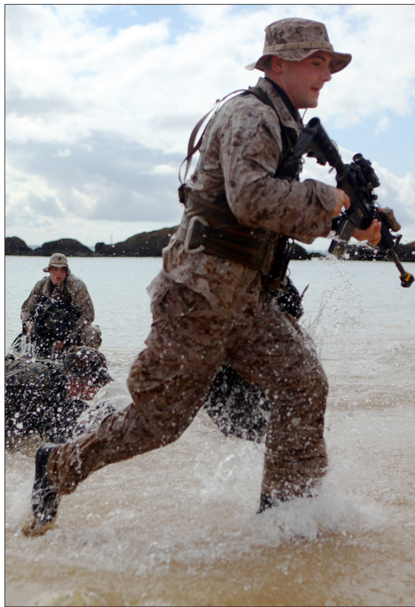
Scout swimmers with A Company push onto the beach, Jan. 29.