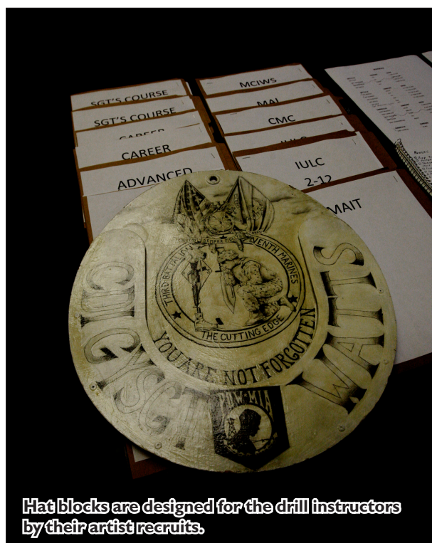
Hat blocks are designed for the drill instructors by their artist recruits.