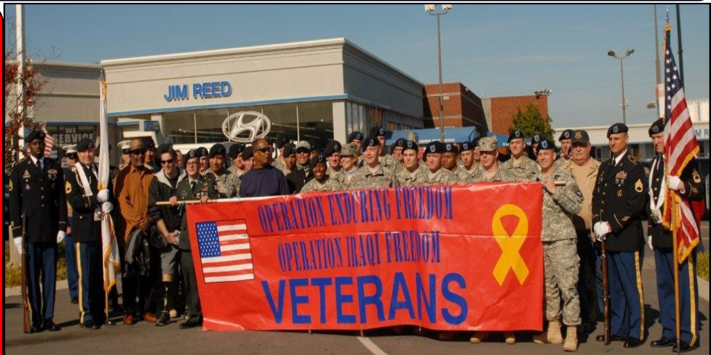
Soldiers assigned to 3rd Brigade Combat Team, 101st Airborne Division (Air Assault) stand with veterans who served in Operation Iraqi Freedom, Operation Enduring Freedom and Operation New Dawn in Nashville, Tenn. November 11, 2011.