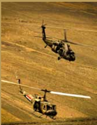
ON THE BACK UH-60 Blackhawk and Iraqi Huey 2