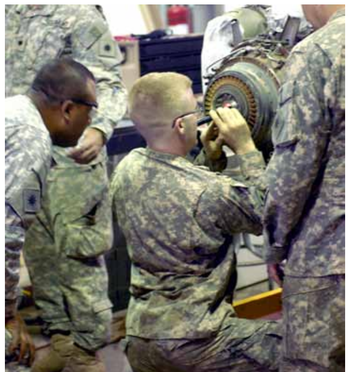
Mechanics of the B Co., 640th ASB work on an engine of a UH-60 Black Hawk.