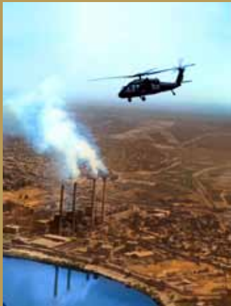
ON THE COVER UH-60 Blackhawk