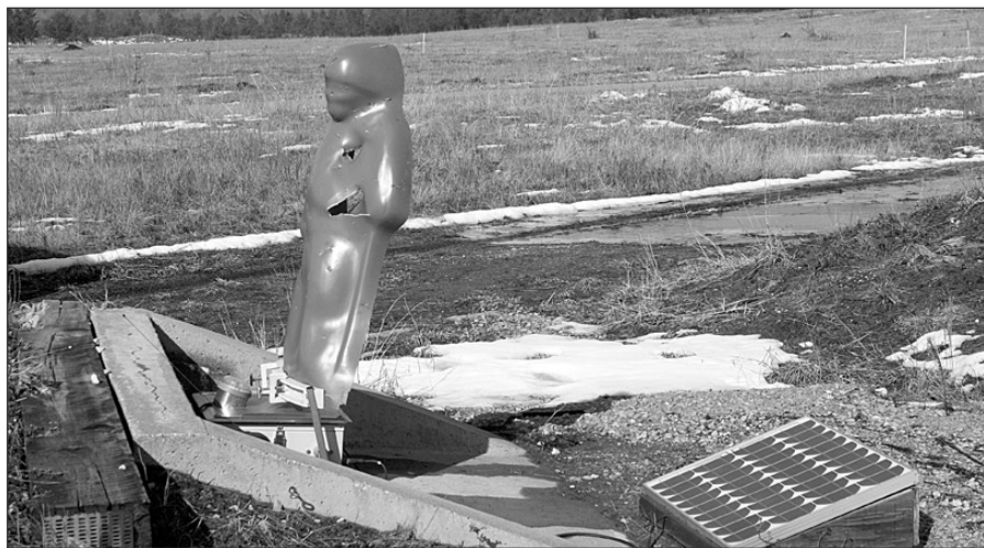
A Stationary Infantry Target on Range 26 at Fort McCoy is powered by a solar panel, located directly behind it.

After having their charges depleted, the batteries had to be brought to a recharger to