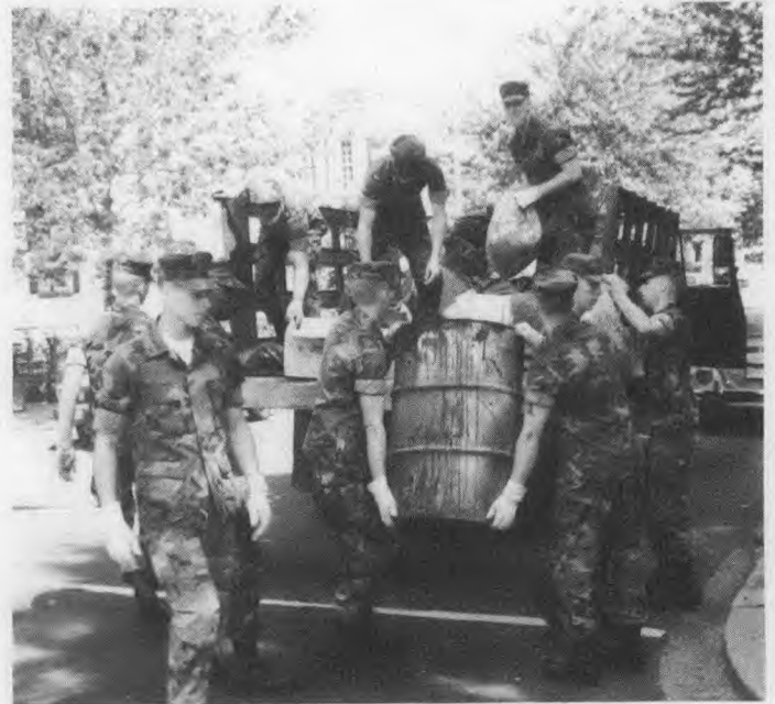
B COMPANY MARINES load up what they found at the corner of 6th and E Streets.

Some 20 garbage truckloads of southeast D.C.'s enemy had been hauled away.