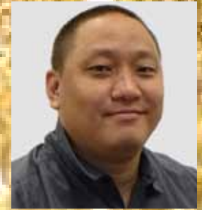
Reid Park Code 970, Shop 64PF Plastic Fabricator