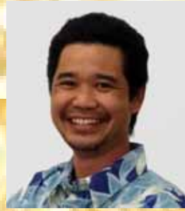
Hoopale Tom Code 920, Shop 26 Welder