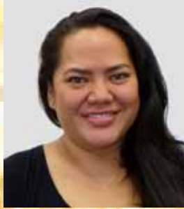
Summer Legros Code 970, Shop 64FW Fabric Worker