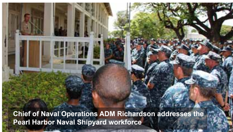
Chief of Naval Operations ADM Richardson addresses the Pearl Harbor Naval Shipyard workforce