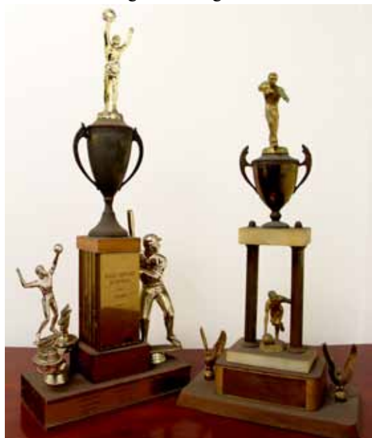
The Shipyard has a long history of champions. Shown here are two trophies earned from Shop 67 (electrical.) On the left, a championship won for basketball in 1960. The other trophy, won in 1958 for a PHNSY family bowling league.

I am always humbled as I walk through the shops and look at the trophies and plaques which are a testament to the desire to win which is engrained in our Command. Many of the awards on display go back to 1945, and were earned by a generation who knew the importance of competition and the difference between winning and losing.